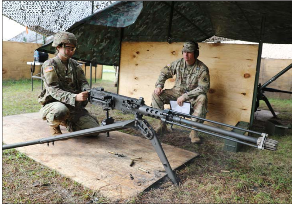
A Soldier assigned to 3rd Battalion, 15th Infantry Regiment, 2nd Armored Brigade Combat Team, 3rd Infantry Division, conducts the M2 machine gun function check task on 7 April 2022 during an expert badge event hosted by the Spartan Brigade at Fort Stewart, GA.

The Training Management Directorate is the Army's proponent for training management. TMD manages, develops, and sustains training management doctrine, processes, products, and systems to enable training and training management across the Army's institutional, operational, and self-development training domains. Fundamental products of TMD include the ATN, DTMS, and the Combined Arms Training Strategies.