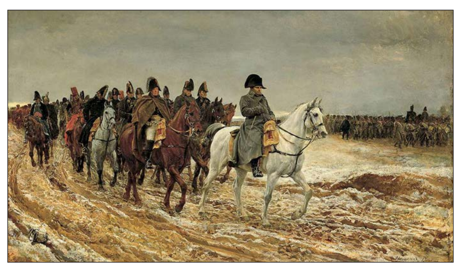
A 1920 painting depicts Napoleon's retreat from Moscow.

The second type were government-paid, -led, and -equipped cavalry and Cossack forces formed into "flying detachments" of up to 500 uniformed or non-uniformed combatants who worked in coordination with the army and attacked the enemy flanks and rear.<sup>3</sup> Both types of guerrillas were important in the war, but the need for central control was obvious.