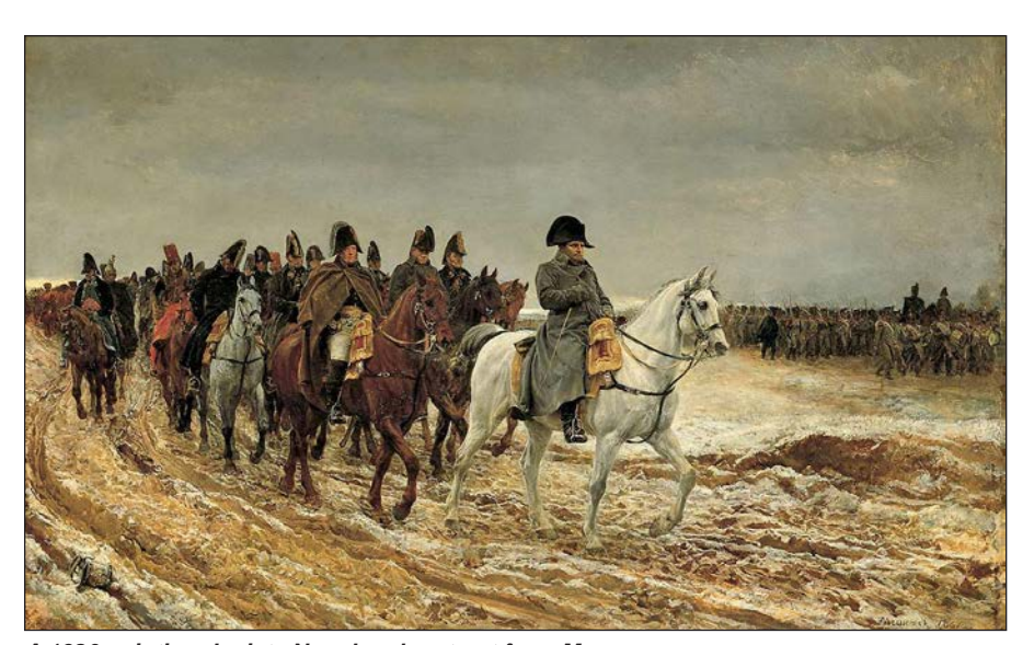
A 1920 painting depicts Napoleon's retreat from Moscow.

The second type were government-paid, -led, and -equipped cavalry and Cossack forces formed into "flying detachments" of up to 500 uniformed or non-uniformed combatants who worked in coordination with the army and