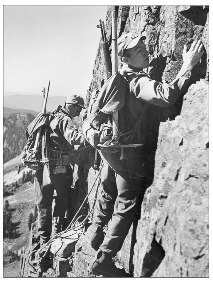
Soldiers in the 10th Light Division (Alpine) train for mountain warfare.

The new 10th Mountain Division arrived in Italy in January 1945 and was incorporated into Fifth Army. With only the expertise of U.S. commanders and its recent training, the division needed to adapt its organization and equipment during its baptism by fire.