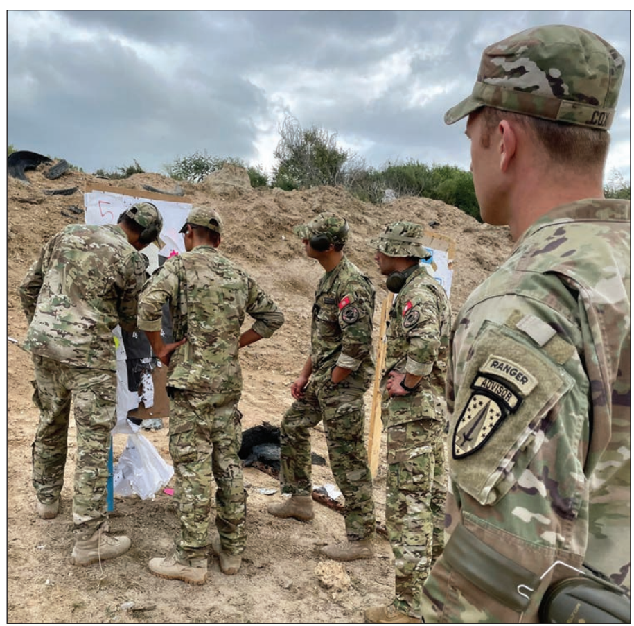
A Security Force Assistance Brigade advisor assesses partner forces at the range.

My former brigade in the 101st did not deploy while I was with them. That is a great thing for our country, but I nonetheless felt like I had missed out, both in how I had anticipated serving and on the tactically and logistically formative experiences of a deployment. Readiness can be a dreaded buzzword. It is the strategic competition mission of the brigade combat team (BCT) and that will not change