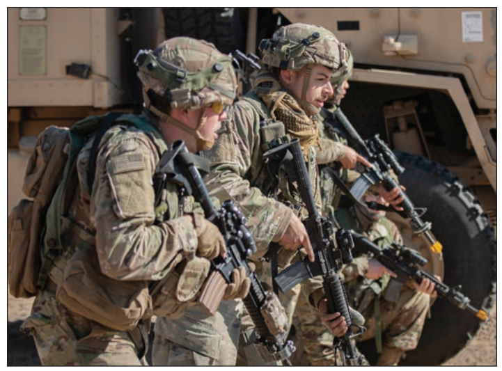
Soldiers with 3rd Battalion, 161st Infantry Regiment "Dark Rifles" pull security during a National Training Center rotation on 14 March 2021.

when to engage the enemy with IDF assets. The S2 then establishes NAIs for observation by all collection assets: unmanned aerial systems (UAS), TF reconnaissance, and forward observers (FOs). S2 then shares fighting products - enemy event template; enemy decision point matrix; intelligence, surveillance, reconnaissance (ISR) matrix; and high-payoff target list (HPTL) — up and down the chain of command to ensure shared understanding and efficient use of collection assets. If any TF asset observes enemy within an NAI, the NAI transitions into a target area of interest (TAI). The enemy is then referenced against HPTL and pre-established target selection standards. Once an HPT is identified in a TAI or target selection standards criteria are met within a TAI, that TAI becomes a "hot" kill box. All or some available assets engage targets in the kill box. When the desired effect meets the desired end state — either destroy, neutralize, or suppress enemy within the kill box — the kill box becomes "cold." The battalion collection assets will then look at other NAIs (potential future kill boxes) to continue to mass effects on the enemy. 14