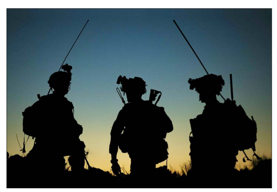
Soldiers discuss mission plans during training at Pohakuloa Training Area, HI, on 18 October 2021.

According to doctrine, this ethic is "the basis of the Army's shared professional identify... guides institutional policy and practice... and unites all Army professionals to live by and uphold." And while the Army ethic is discussed at length in doctrine, one might be challenged to hear a conversation about it in the operational force. This lack of discussion may occur for many reasons, one of which could simply be a misunderstanding of what it means. If the ethic is misunderstood, it will likely be misapplied in the operational environment. Or as in many cases, the Army