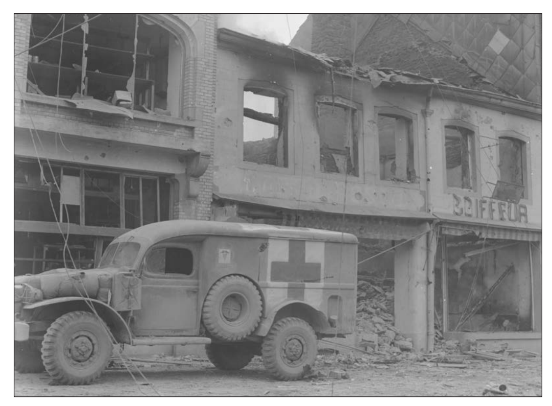
An ambulance sits on a street in Bastogne after the relief of the town and evacuation had resumed.

Prolonged care is a new term for an old reality. It is officially defined as the need to provide patient care for extended periods of time when evacuation or mission requirements surpass available capabilities and/or capacity