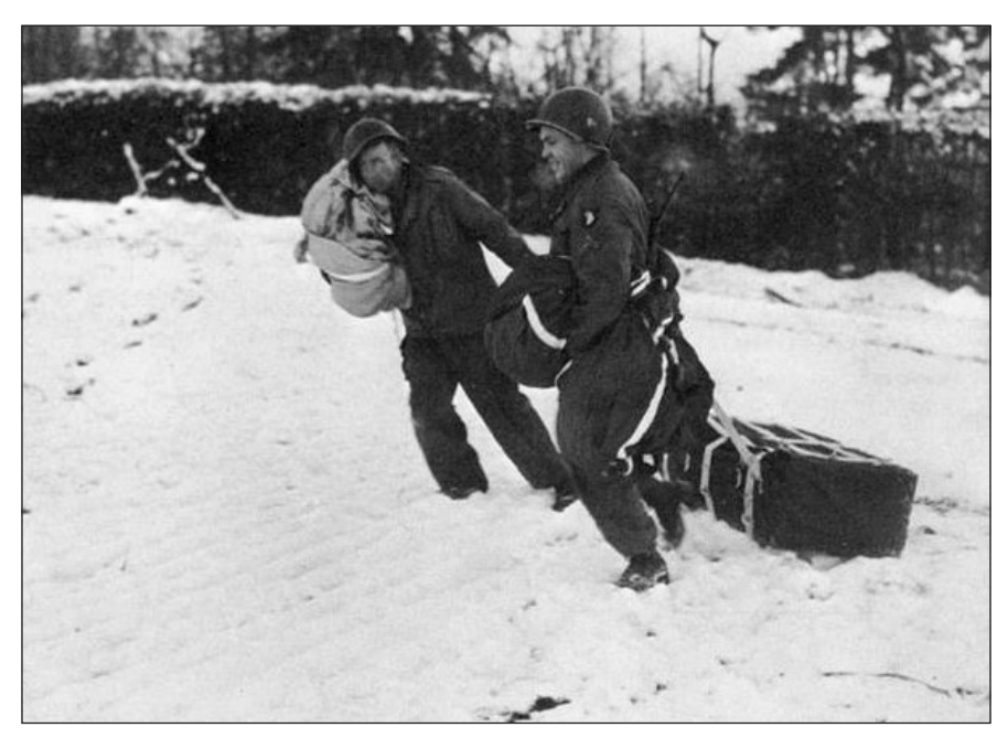
Paratroopers recover medical and other supplies air dropped into the pocket.

The cost in life during prolonged care in Bastogne is unclear. After the capture of the 326th Airborne Medical Company, there was no central management of collecting and only a few fragmentary records were kept. One report counted 33 deaths during treatment from 19-31 December. A Third Army medical investigation later concluded that the mortality of casualties in Bastogne was actually surprisingly low.<sup>29</sup> So long as no vital organ was damaged, Soldiers with even serious wounds to the stomach or chest often survived to be evacuated and treated, although they were in excruciating pain. Yet less serious wounds often became so infected or frostbitten that amputation was the only treatment, so many survivors were maimed for life. By the time the 101st Airborne Division was pulled off the frontline in early January 1945, it had lost 482 killed, 2,449 wounded, and 527 missing or captured. The armored, tank destroyer, and field artillery units in the Bastogne pocket reported 117 killed, 422 wounded, and 134 missing or captured.<sup>30</sup> The totals certainly would have been higher without the ceaseless efforts of the surgeons and medics in Bastogne.