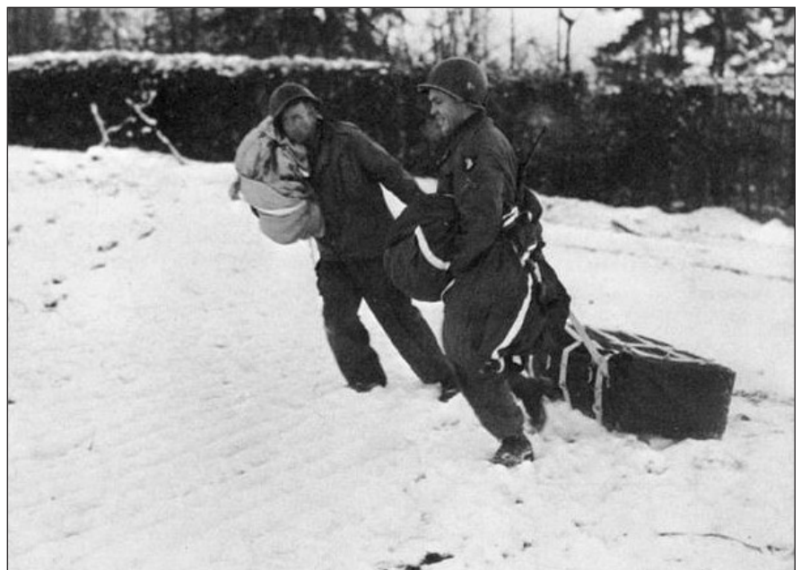
Paratroopers recover medical and other supplies air dropped into the pocket.

The overcrowded and dirty conditions meant that infection and gangrene were rampant at every aid station. Many wounded Soldiers never made it to one of the main collecting