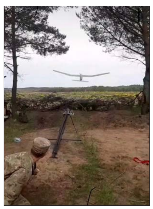
A Soldier launches a Puma from a concealed location.

attack by flying a quadcopter at eye level and in plain view of a tank commander's (TC's) head while the tank was stationary in an SBF position (certainly a disconcerting experience for the TC) and proceeded to chase the tank across the field as it fled obvious enemy observation. He was particularly effective when paired with a fire support officer (FSO) and some engagement criteria; on multiple occasions the pair would destroy enemy formations with particularly accurate indirect fires, reporting the battle damage assessments (BDA) as they went.