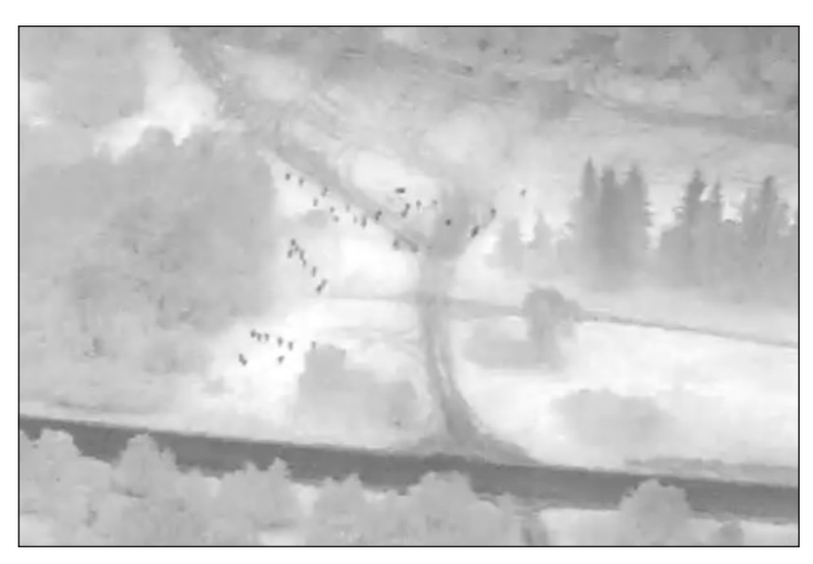
Figure 2 — Another OPFOR SUAS operator view. This time the company is moving towards the follow-on objective after realizing they are under enemy observation. Enemy artillery began impacting shortly after this picture was taken.

tank section having been alerted and directed to an effective position by the SUAS operator). The company was not in an effective posture to deal with this threat and continued to take casualties.