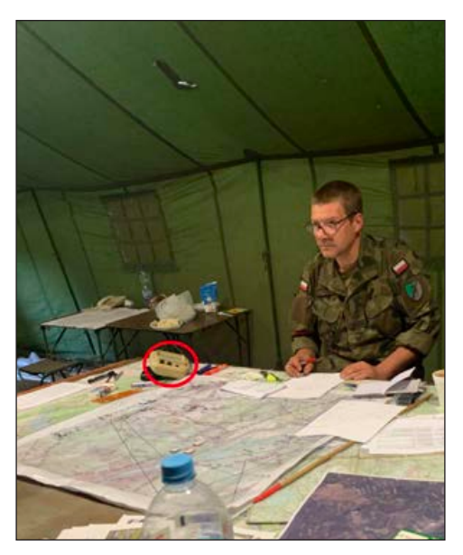
A battalion commander keeps the Puma hand controller close at hand for real-time intelligence.

The company rapidly crossed the LDA and entered the assault position while preparatory fires were placed on the objective. Team 2 gathered the Soldiers it had cross-trained and equipped with additional UAV jammers and placed them according to plan, establishing an anti-UAV screen. Once set, Team 2's NCO gave the thumbs up to the platoon leader. Fires onto the objective were shifted, and the assault commenced with Team 1's weaponized drones overhead in support while the commander patiently observed the operation through Team 3's Puma feed.