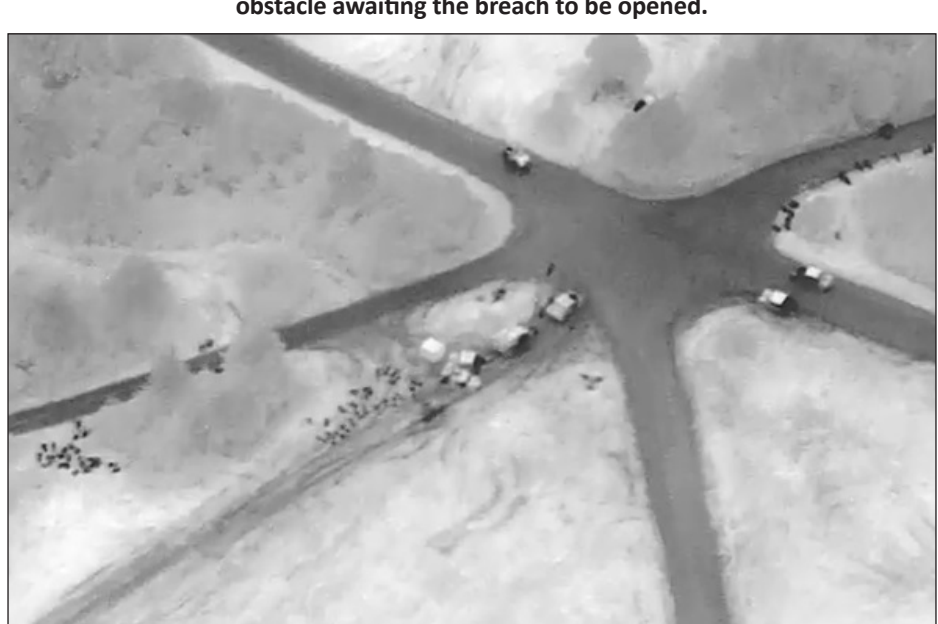
Figure 1 — A view from the opposing force small unmanned aerial system operator's mission computer of the rotational training unit consolidated on their side of the obstacle awaiting the breach to be opened.

Recognizing their location was compromised, the company consolidated into a column formation with minimal spacing and attempted to move expeditiously towards its follow-on objective. Within moments enemy indirect fire was landing amongst the now consolidated company, causing casualties and disrupting the formation. As the company started to run out of the effects area, Soldiers began to bunch up. After 200 meters they were surprised when they ran into an enemy tank section overwatching a key intersection along their avenue of approach (the