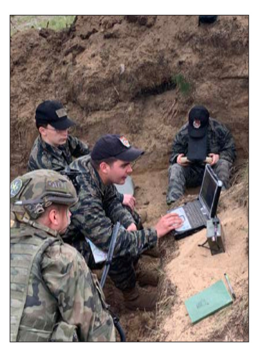
The SUAS section works with a joint terminal attack controller to identify targets for close air support.

certainly in the process of getting better. Their impact on the battlefield can reasonably be expected to be significant. All of this would imply that commanders must understand at a minimum the capabilities and limitations of the systems available to them, as well as those of their enemy.