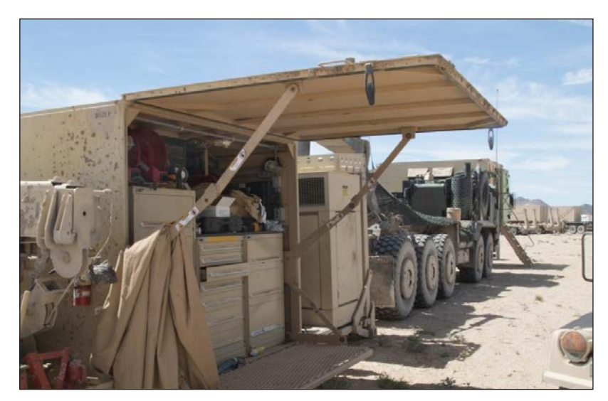
Use of a unit maintenance control point during RSOI allows the rotational training unit to maximize the efficiency of every maintainer on ground.