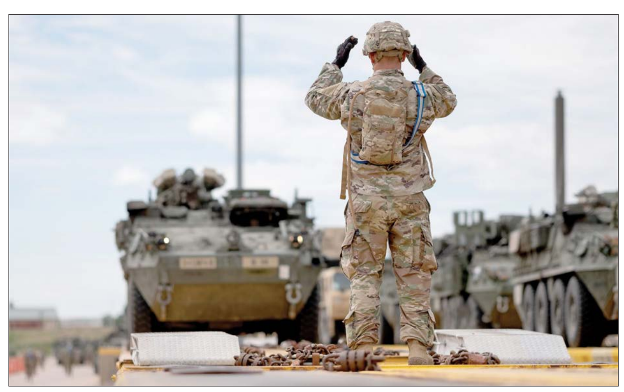
A 4th Infantry Division Soldier conducts rail load operations on 23 July 2020 at Fort Carson, CO, in preparation for a rotation at the National Training Center.

To support this vision, our brigade combat team (the 1st Stryker Brigade Combat Team, 4th Infantry Division at Fort Carson, CO) skipped the rotational unit bivouac area (RUBA) and deployed directly into the Mojave Desert — an austere, contested environment — during one of the hottest months ever recorded in California's history. From there, we immediately prepared for combat operations against a formidable enemy. There was no reprieve, shelter, or comfort — and we believe we fought better because of it.