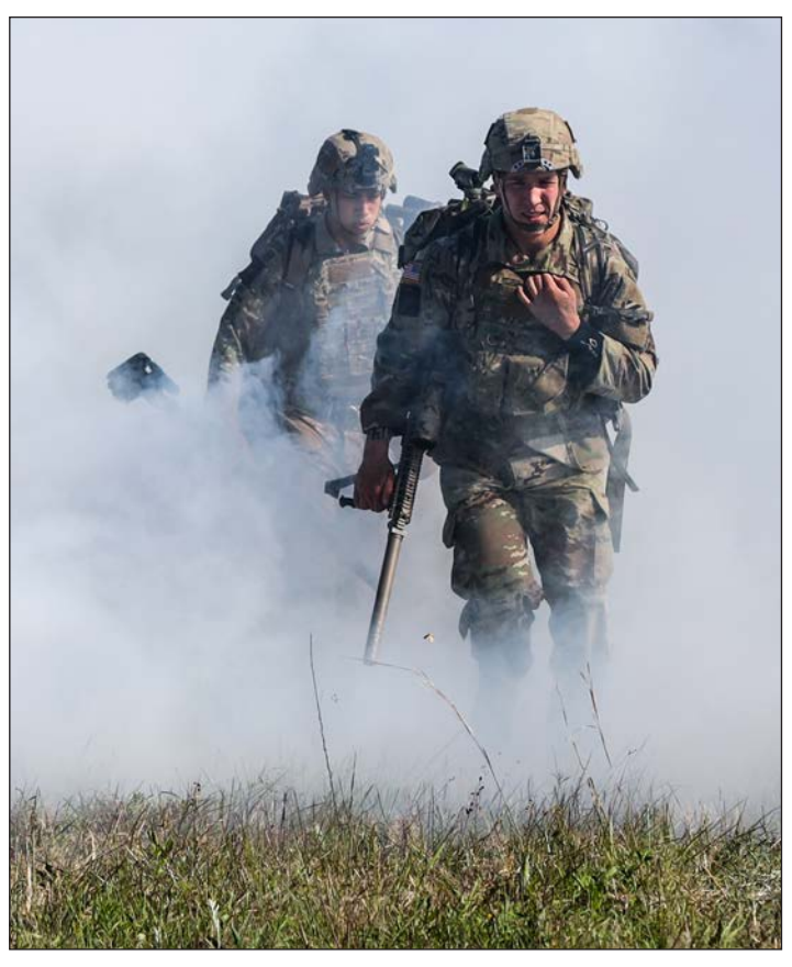
A team competing in the Best Sniper Competition runs to the next objective of an event on 14 April.