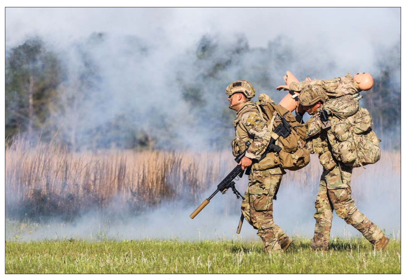
A sniper team completes the Red Ants event of the Best Sniper Competition where competitors patrol and engage targets while executing a casualty evacuation.