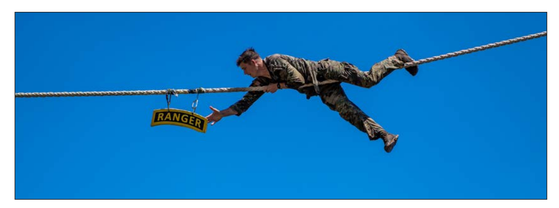
A Best Ranger competitor completes a portion of the Combat Water Survival Assessment on the last day of the competition.