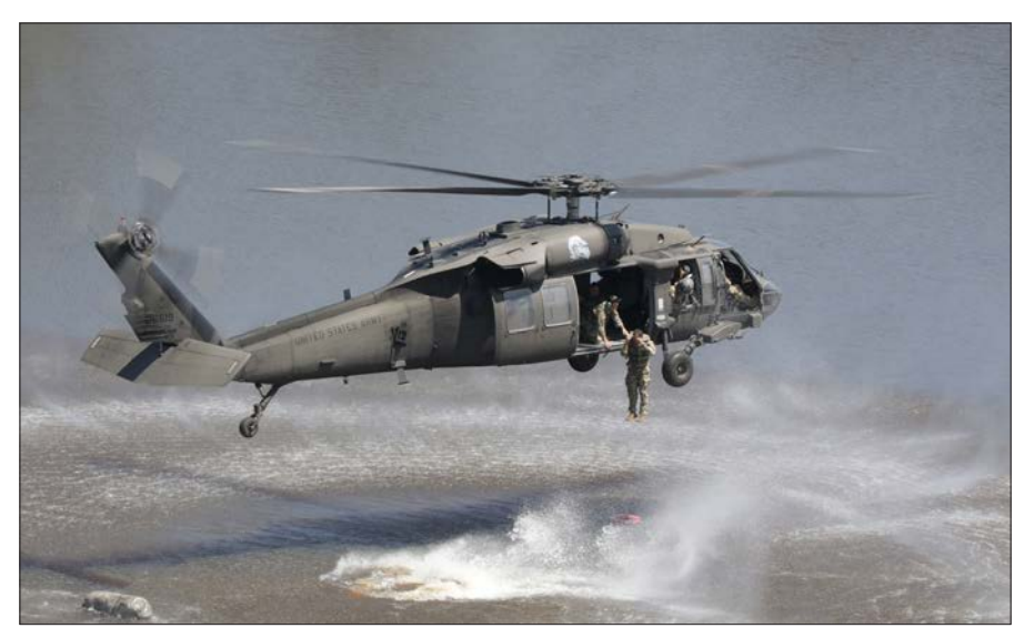
Best Ranger competitors drop into Victory Pond during the helocast event on 18 April, the third and final day of the competition.