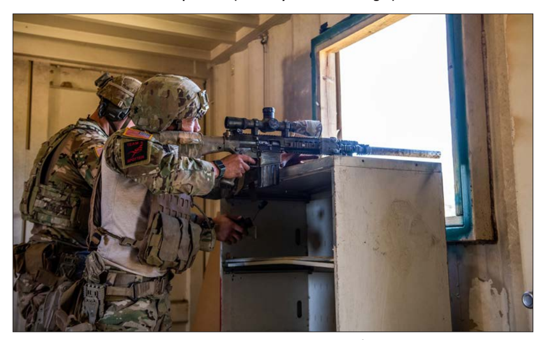
A sniper team prepares to engage a target on the second day of the Best Sniper Competition at Fort Benning on 13 April.