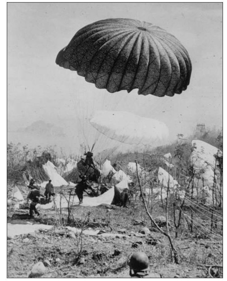
Paratroopers, supported by ground forces, land on Corregidor during the combined assault launched on 16 February 1945.

On 16 February 1945, the stage was set: aggressive Allied flexibility versus rigid Axis doctrine. The fate of the Pacific,