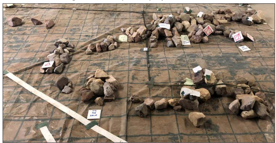
Figure 2 — Example Company Terrain Model

Camouflage Netting — Companies should not begin thinking about camouflage netting placement at the intermediate staging base (ISB). They should do so at home station before deploying to a CTC. Proper mounting and placement of the netting are vital to ensuring that the nets can be safely and effectively stored when moving. Placement will prevent the nets from getting caught in wheels or tracks while ensuring successful camouflaging of vehicles. When mounting camo netting, commanders also need to consider openings for MILES sensor gear to ensure that the net is not blocking their ability to read opposing force (OPFOR) lasers.