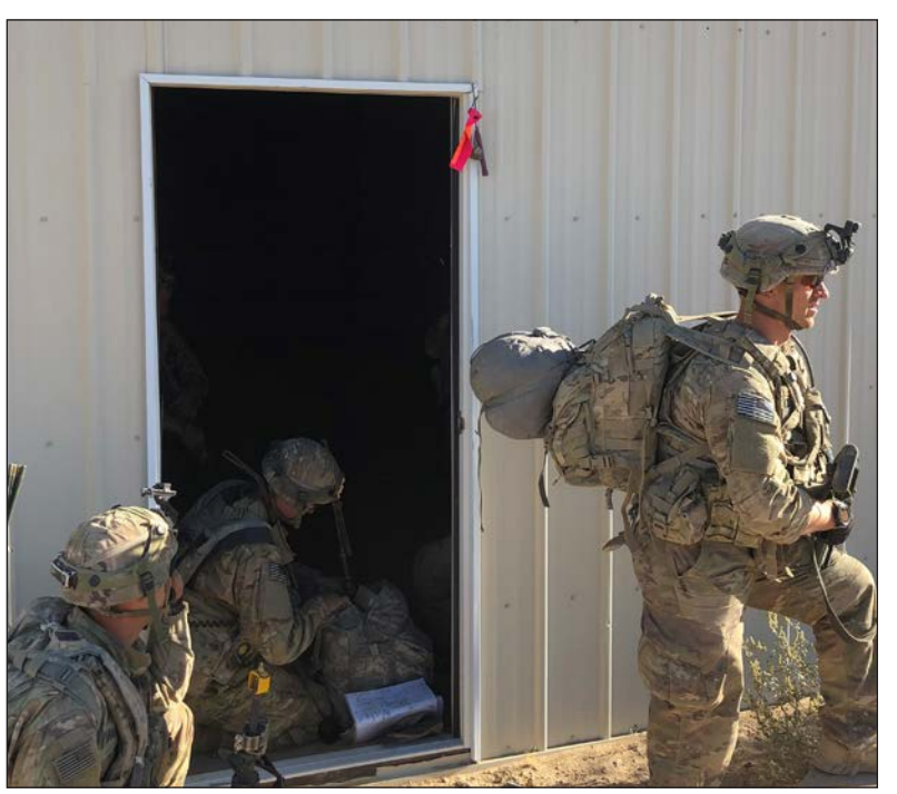
Soldiers stand by after clearing a room. Note the foxtail at the top of the door.

Assembly Areas — Does your company already have an SOP to occupy an assembly area (AA), or are you going to have a 10-minute conversation on the company net about how you want to emplace? Establish the SOPs for occupy-