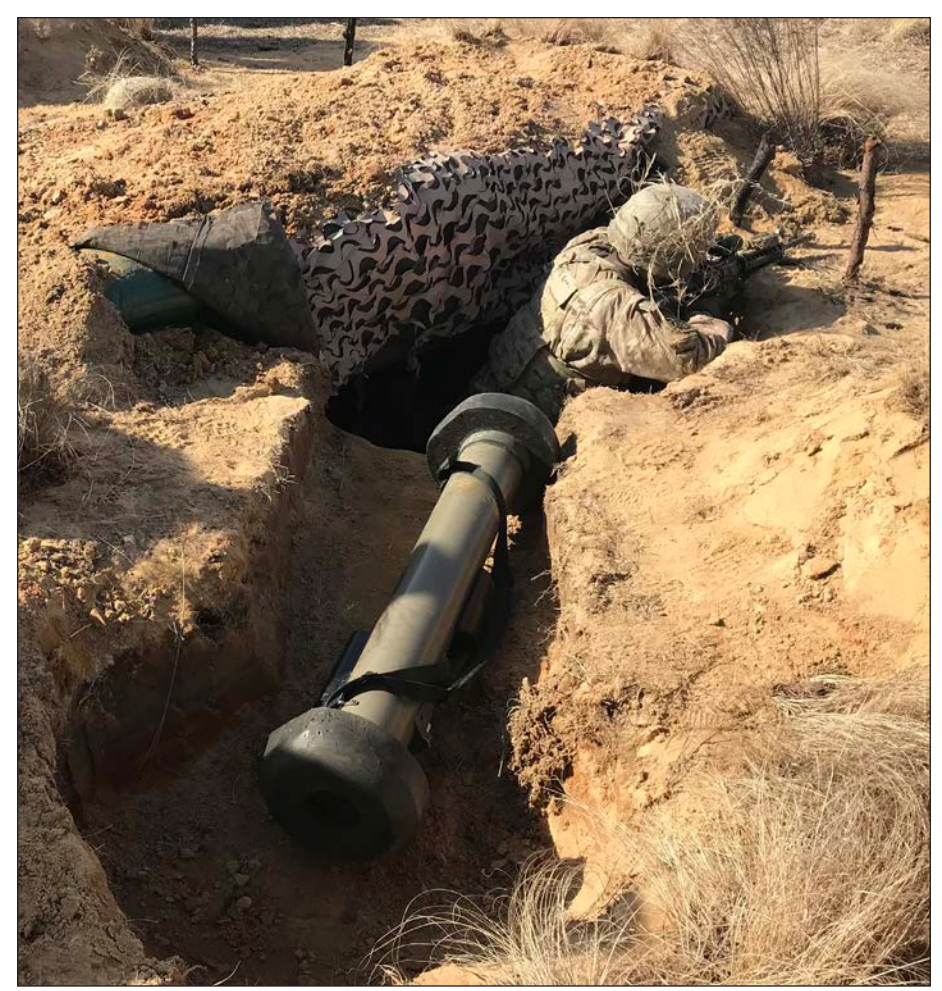
A Soldier occupies his Javelin battle position at the National Training Center, Fort Irwin.

ing AAs both dismounted and mounted before your rotation. It can be as simple as this: The lead element always has the 9 to 3 by way of 12; the second element has the 3 to 6 by way of 6; and the third element has the 6 to 9 by way of 6; and company trains will locate just above the 6. Whatever you decide it to be, establish it and rehearse while at home station. Do not try to do it for the first time at 0300 in the rain while in the middle of a force-on-force engagement.