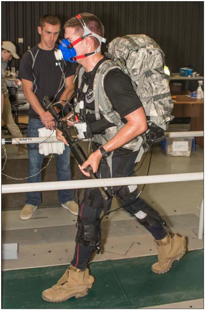
A Soldier wears an exosuit while on a treadmill at a U.S. Army Research Laboratory facility at Aberdeen Proving Ground, MD, on 15 June 2017. The suit is part of the Army's Warrior Web Program.

Additional concerns about the Guardian XO is that the "amount of maintenance required will vary based on customer use cases and the operating environment."18 This may translate into a need for regular maintenance in the demanding environments military personnel work in. The