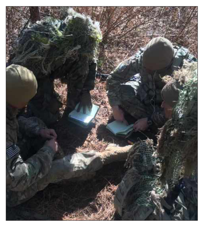
Electronic warfare specialists partnered with a sniper team from the 1st Squadron, 73rd Cavalry Regiment to enable cross-domain maneuver during the ACME.

A thorough understanding of your unit's own communications systems is both a beneficial and necessary requirement during multi-domain operations. Possessing a basic understanding of the associated signature(s)