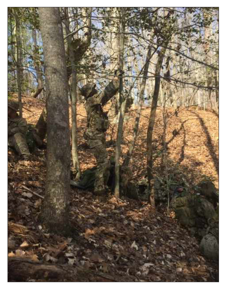
A scout observer from the 1st Squadron, 73rd Cavalry Regiment prepares to emplace a high frequency radio antenna during the ACME.

of elements of a dismounted reconnaissance troop simply integrated with "enablers" under the command and control of an Infantry command team. Moreover, Paratroopers within the task organization possessed both a basic understanding of the duties and capabilities of every MOS within their task organization and a rudimentary ability to execute these duties and provide these capabilities. By the end of the ACME, the C Troop and MICO formation demonstrated the ability to conduct cross-domain maneuver while conducting multi-domain operations.