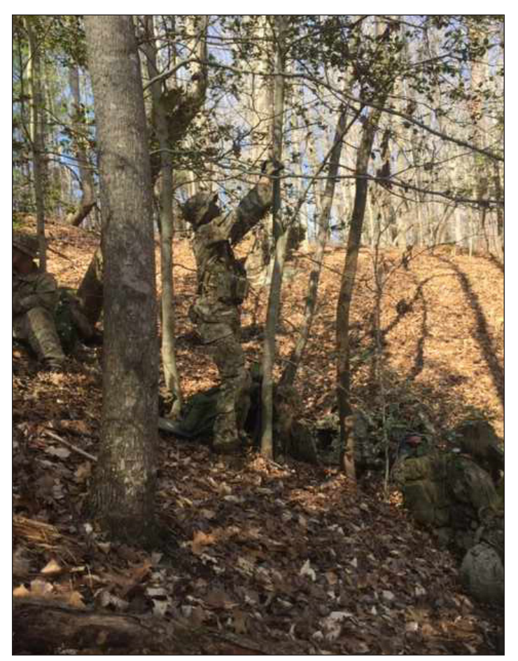
A scout observer from the 1st Squadron, 73rd Cavalry Regiment prepares to emplace a high frequency radio antenna during the ACME.