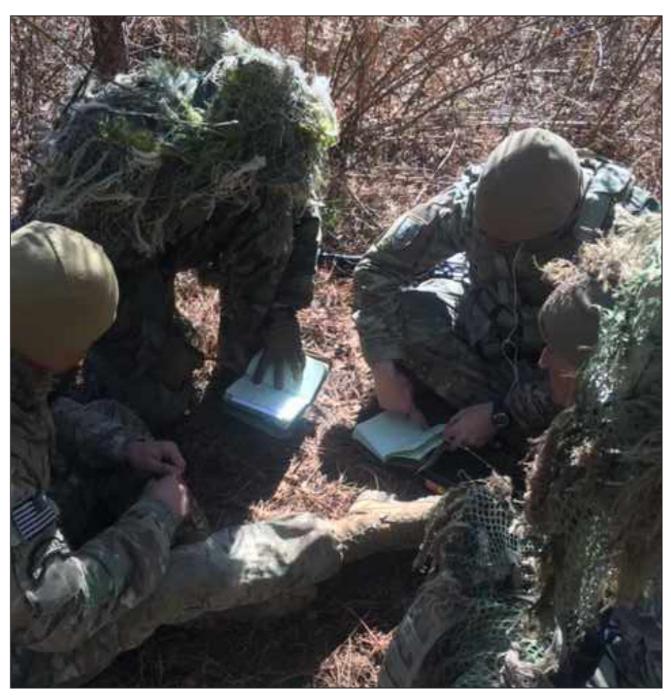
Electronic warfare specialists partnered with a sniper team from the 1st Squadron, 73rd Cavalry Regiment to enable cross-domain maneuver during the ACME.

A great deal of success against a hybrid adversary occurs during intelligence preparation of the battlefield (IPB). It is critical that those conducting IPB develop a thorough understanding of all communications arrays, detection measures, and trends. While conducting terrain analysis, leaders must also examine the EMS. Does the OE have dense urban terrain, which features a vast array of layered communications networks and multiple systems, or in contrast does the OE feature rudimentary technology in austere locations with little to no preexisting communications networks and arrays? Next, a complete