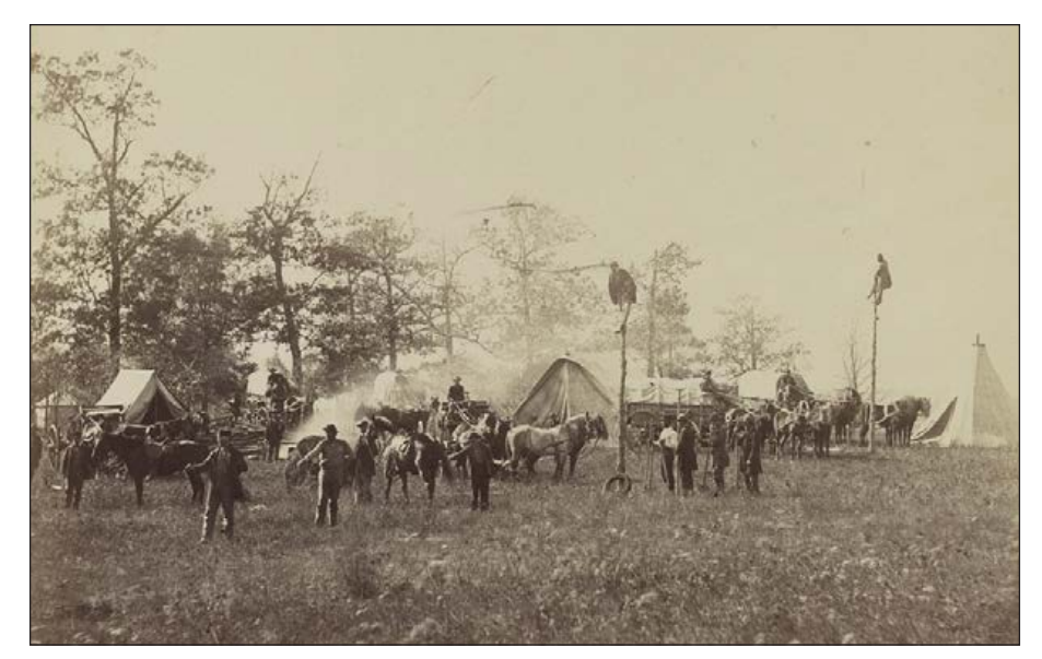
Men with the Army of the Potomac's Telegraph Construction Corps put up wire in April 1864. (Photos and artwork from the Library of Congress Prints and Photographs Division)

innovations were used in concert to achieve a single aim — primacy. For example, the late-1860s British venture in China demonstrated that steam-powered vessels could sail upstream or against the wind and deposit a force armed with repeating rifles, and which could communicate over-the-horizon via the telegraph.<sup>5</sup> Like most changes, none of the above three developments occurred overnight but were decades in the making, and they could have been accounted for through doctrinal innovation before the outbreak of a major conflict between industrial powers. But they were not.