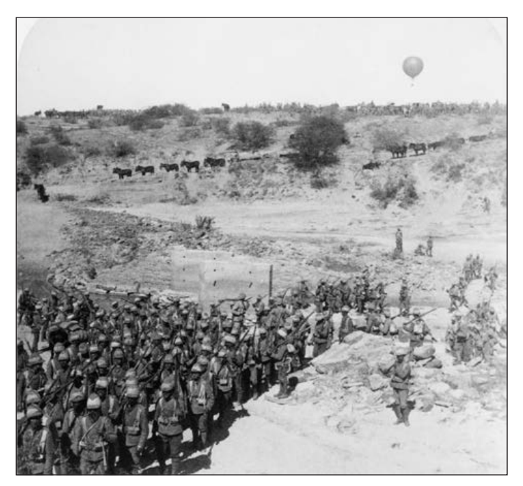
Lord Roberts' infantry crosses the Zand River in South Africa. Note the balloon in the background that was watching ahead for the Boers.

Britain's lessons from the Boer War were mixed. On the one hand, the British overhauled their ability to wage a prolonged war with the creation of a chief of the general imperial staff along with enhanced organizational measures to both project and sustain a large force far from the British Isles in concert with increasing the sizes and numbers of the standard field guns.<sup>29</sup> On the other hand, the central lesson from British setbacks during the war — that advances in modern weaponry favored the defender over the attacker — was discounted. Instead and counter-intuitively, the British doubled down on the decisiveness of the frontal attack and officially codified the tactic as the form of maneuver of choice in the 1912 Field Service Regulation.<sup>30</sup> Nevertheless, it was high velocity and capacity, smokeless powdered rifles and machine guns used in concert with trenchworks that worked to the advantage of the defender, a fact that was replaced with the British myth that the Boers were simply better shots and more cunning than their British adversaries.<sup>31</sup> The result was a more capable and empowered shepherd to lead the masses of ignorant sheep to the slaughter.