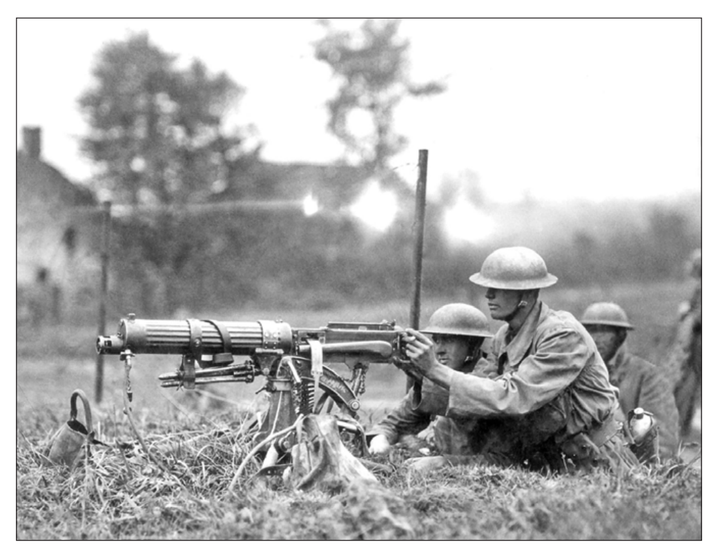
A Vickers machine-gun team from Company B, 115th Machine Gun Battalion, 30th Division, prepares to engage in Bibeauville, France, on 19 October 1918.