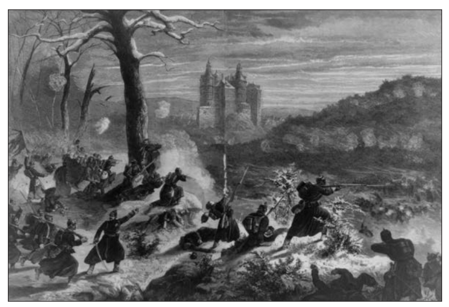
This print illustrates a battle in January 1871 between Prussian infantry (advancing from the left) and French forces (retreating to the right) in the Lisaine River valley with the Château de Montbéliard in the distance.

The French credited German success in the two previous wars to the Prussian breech-loading needle gun, an egregious error on the part of the French who felt once again at parity with the Prussians with the adoption of their own breech-loading variant, the 1866 Chassepot which outranged the Prussian needle-guns.<sup>19</sup> Few French leaders saw past this myth to see that the special ingredients to Prussian victory lay in the ability to train a short-service conscript army, mobilize said army rapidly, and transport it in an orderly fashion with all needed supplies and enablers to critical points.<sup>20</sup> Emperor Napoleon III, the nephew of the infamous Bonaparte, sought to place France and the Second Empire on firmer war-footing, but his efforts were thwarted by a combative French general staff which resisted reforms and significant legislative budget cuts from 1869-1870. Nevertheless, by July 1870, the French Chief of the General Staff LeBeouf reported to the French government that the French army was ready for war. France had adequate stocks of ammunition, clothes, food, and Chassepots, and by the standards of the day, France was prepared for a war with an army formed and trained in like fashion; however, France failed to realize it was on the eve of an entirely new age of warfare and outnumbered 417,366 to Prussia's 1.2 million trained soldiers.<sup>21</sup>