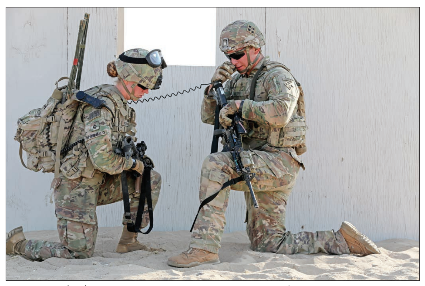
A platoon leader (right) and radio-telephone operator with the 1st Battalion, 8th Infantry Regiment, 3rd Armored Brigade Combat Team, 4th Infantry Division, send up a report during training at Camp Buehring, Kuwait, on 24 July 2019.