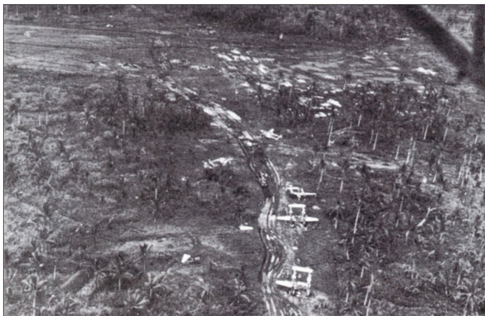
M. Hamlin Cannon, United States Army in World War II: The War in The Pacific - Leyte: The Return to the Philippines

Unable to attack again on 9 December due to a lack of ammunition and under orders from the regimental commander, the 1st Battalion changed its scheme of maneuver for an offensive on 10 December, with two companies conducting an envelopment to the west with a third in support. 33 Despite the fact that two of the advancing companies mistakenly got into a firefight with each other, fortunately producing minimal casualties, the new maneuver allowed the advancing infantry to systematically reduce the Japanese strongpoints until nightfall halted operations. The following day saw the 1st Battalion complete its clearance of the airstrip, with the battalion claiming 300 Japanese dead and forcing the withdrawal of 200 more at the cost of 40 killed and 100 wounded. 34 Although it took some adjustment, even the 149th Infantry demonstrated adaptability in counterattacking the Japanese.