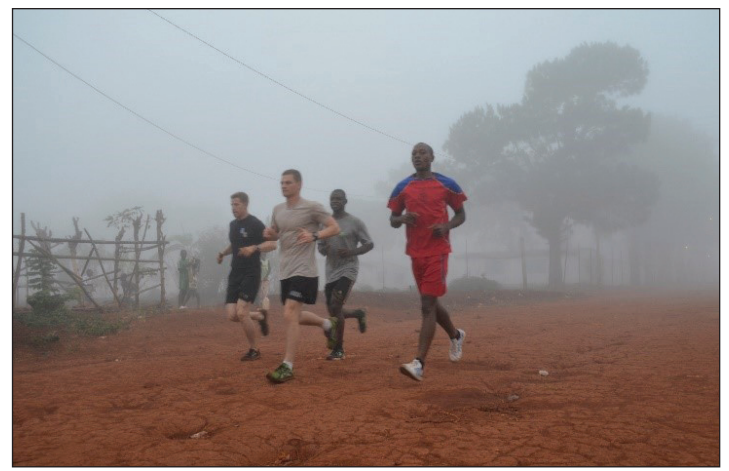
U.S. and Cameroonian Paratroopers conduct physical training during an exercise in Cameroon.

of strength under fire. The willingness to push through pain and the journey of continual self-improvement is respected by both groups from vastly different backgrounds.