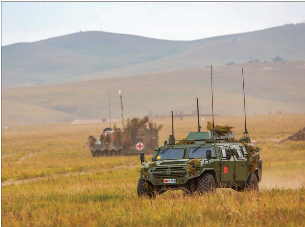
A PLAA CSK131 high-mobility vehicle serves in a support role at the VOSTOK-2018 exercise in Russia. The CSK131 is a six-person chassis that can perform a variety of roles, including assault, command and control, reconnaissance, and troop transport. An extended chassis variant, the CSK141, can transport 10 personnel and is the primary maneuver vehicle in new PLAA HIMOB combined arms battalions.

To accomplish these missions, the Science of Military Strategy proclaimed the necessity to reduce the number of heavy armored forces and make use of modern light and medium units capable of transitioning the PLAA from area defense to all-area maneuver and three-dimensional attack. The text also proclaimed that these light units should be capable of highway, rail, sea, and air transportation to provide the PLAA a rapid force projection capability that integrates digitized platforms and strong firepower. 3