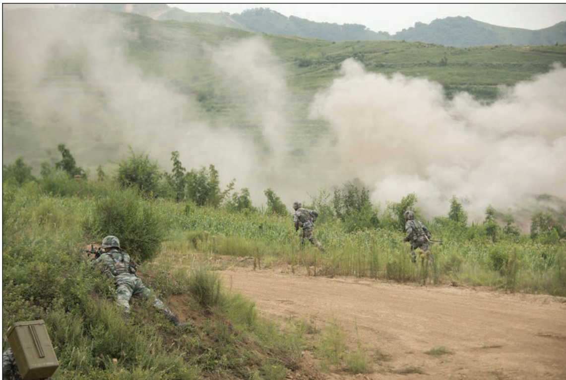
PLAA soldiers carry out an attack exercise in August 2017.

The PLAA HIMOB CA battalion concept provides China with a unit type that does not have an equal in construct. Its modularity and level of informationization enables it to move from being a unit that serves as part of a large formation to a combat unit capable of independent missions. 38 The universal CSK- and MV3-series chassis streamline maintenance, repair, and supply issues, while the heavy weapons equipped on those platforms create a powerful opponent for adversaries. Most importantly, their lightweight equipment turns these forces into a highly