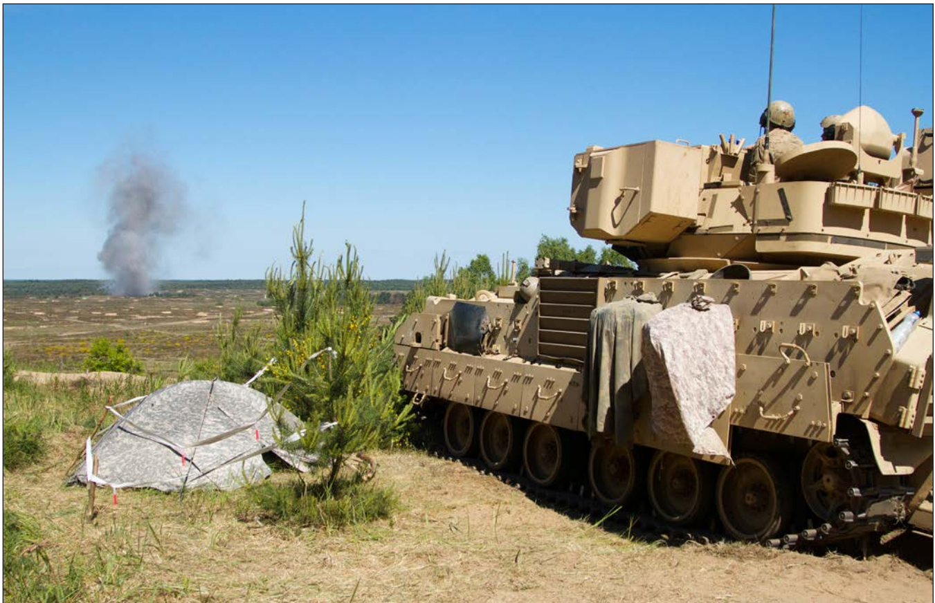
Fire support specialists utilize the M7 Bradley Fire Support Team (BFIST) vehicle and the Fire Support Sensor System (FS3) to identify targets and call for fire (CFF).

In addition to the doctrinal changes in supply and maintenance policies, there must be a deliberate education of maneuver commanders originating from the field artillery battalion headquarters executed by the respective battalion fire support officers (FSOs). Executed through the respective battalion FSOs, the gaining units will gain an appreciation and ownership of the system of systems inherent in digital fire support equipment. Ultimately, the maneuver commander maintains training responsibility authority and is responsible for the integration of fires within the area of operations (AO). 5 The credibility of the fires warfighting function begins long before the call for fire, the combined arms rehearsal, or even the fires rehearsal. Trust between maneuver and the fires community is built upon a foundation of credibility. Accepting absolute responsibility of these gains is in fact contrary to AR 710-2, but it is requisite to incorporate the fires warfighting function successfully.