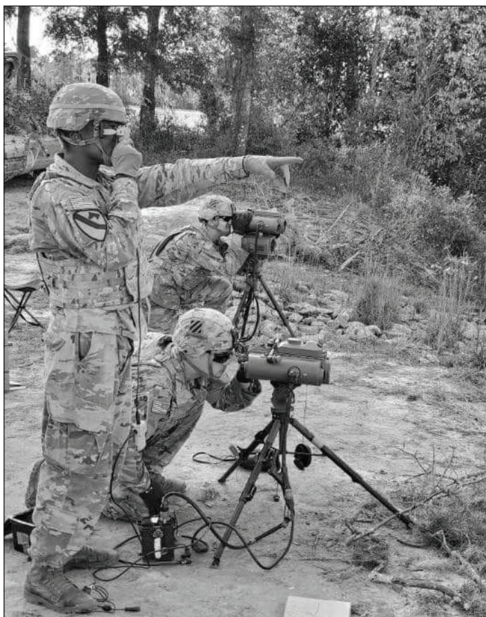
Fire support Soldiers assigned to Headquarters and Headquarters Battery, 1st Battalion, 9th Field Artillery Regiment, employ a Lightweight Laser Designator Rangefinder utilizing a remote heads-up display for artillery observation spottings and corrections.

types of responsibility hold the gaining unit responsible for the majority of actions concerning the equipment such as proper custody, routine/scheduled maintenance, security, disposition, and formal accounting requirements. It is imperative to note that authorization of a temporary loan agreement between PHR holders within a component is the property book officer (PBO), implying that the BCT PBO outlines all circumstances of the temporary loan agreement leaving as little to interpretation as possible.