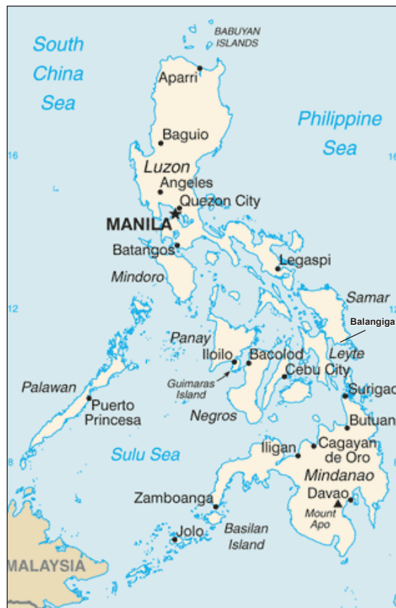
Map 1 — Philippines

In October 1897, a major typhoon struck the Leyte Gulf and had a terrible impact on the Philippines. Father Jose Algue of the Observatorio de Manila described it as the “montaña o masa de agua” (the mountain or mass of water) and reported that Samar and Leyte bore the brunt of the storm. 1 As a result of the typhoon, fishermen and farmers lost their livelihoods. Virtually all provisions that had been stored were destroyed. The Barrier Miner , a newspaper from Broken Hill, New South Wales, reported that an estimated 7,000 people were killed. Numerous ships were wrecked and their crews lost. 2 The few photographs that exist of the aftermath clearly show vast areas wiped clean of trees, houses, churches, and crops. The coconut trees that the locals relied on for income were decimated by the typhoon, and a coconut palm takes four to five years to become productive. Conservative estimates of the resulting food shortage and economic collapse placed the period for recovery at a decade. 3 But the town of Balangiga on the island of Samar did not have a decade to recover. American troops would arrive in four short years. The stage was set for the U.S. Army’s worst defeat since George Armstrong Custer met his end at Little Big Horn 25 years earlier. As the Spanish-American War ended in 1899, Filipinos expected to be liberated from Spain. Instead, the United States