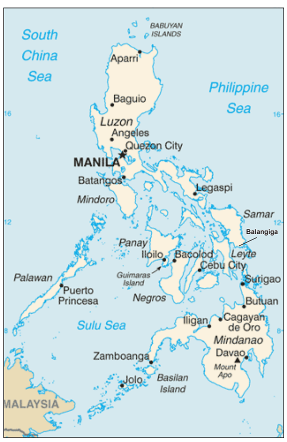
Map 1 — Philippines

South Wales, reported that an estimated 7,000 people were killed. Numerous ships were wrecked and their crews lost.<sup>2</sup> The few photographs that exist of the aftermath clearly show vast areas wiped clean of trees, houses, churches, and crops. The coconut trees that the locals relied on for income were decimated by the typhoon, and a coconut palm takes four to five years to become productive. Conservative estimates of the resulting food shortage and economic collapse placed the period for recovery at a decade.<sup>3</sup> But the town of Balangiga on the island of Samar did not have a decade to recover. American troops would arrive in four short years. The stage was set for the U.S. Army's worst defeat since George Armstrong Custer met his end at Little Big Horn 25 years earlier.