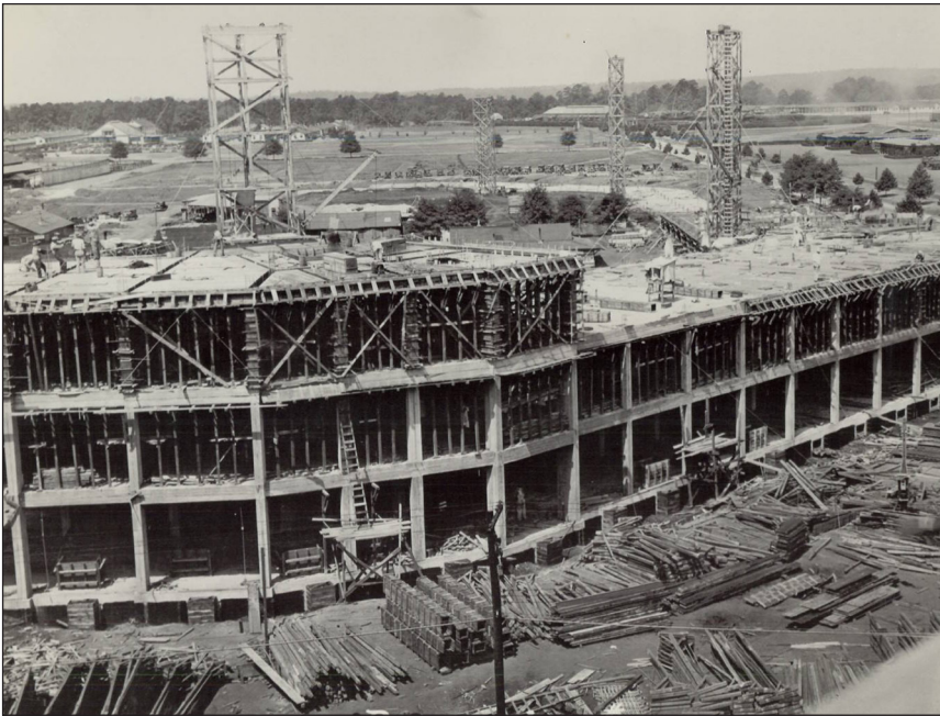
One of the three cuartels built between 1925-1935 is shown under construction.

to locate the boundaries of the reservation practically as he chose. Action then began to acquire the property, including the large frame house which now serves as the home of the commanding general.