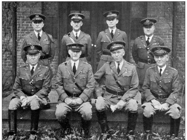
1931 Doughboy Yearbook

The 1930s brought the great depression and with it massive doses of government spending. Fort Benning came in for a