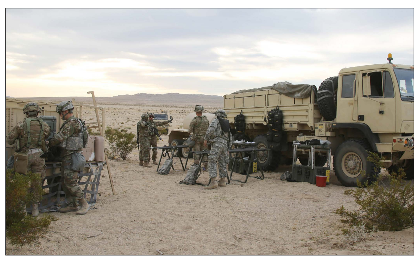
Soldiers assigned to the 3rd Squadron, 3rd Cavalry Regiment assemble a casualty collection point at Fort Irwin, CA, on 10 February 2018.

Both digital and analog COPs complement each other with redundancy if the combat trains is on the move. Distributing this information rapidly/real time allows for a shared understanding. Maintaining a sustainment COP and a maneuver COP allows sustainers to nest logistics planning, execution, and forecasting. It is the S4's goal to maintain a sustainment COP tracking the same information at the company CPs, battalion TOC, CTCP, field trains command post (FTCP), and brigade support area (BSA) for shared understanding.