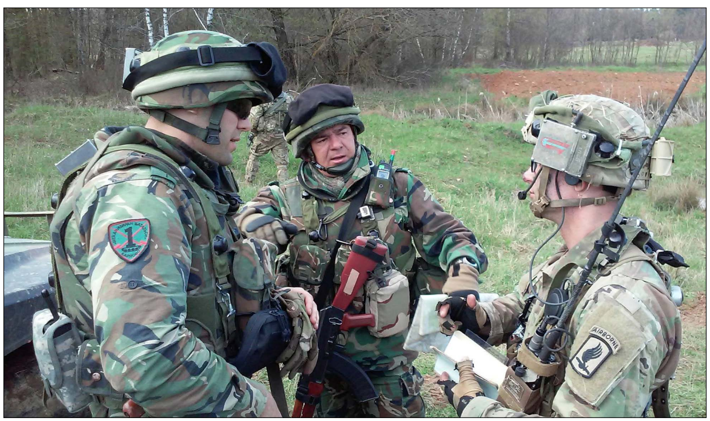
A CoIST analyst confers with multinational allies during Saber Junction 16 at the Joint Multinational Readiness Center in Germany.

standard operating procedure (SOP) nor a deliberate system for information sharing or analysis leveraging the CoISTs, and company commanders employed the analysts to varying degrees. The other battalion had a formalized SOP both for training and during operations and used CoISTs to great success.