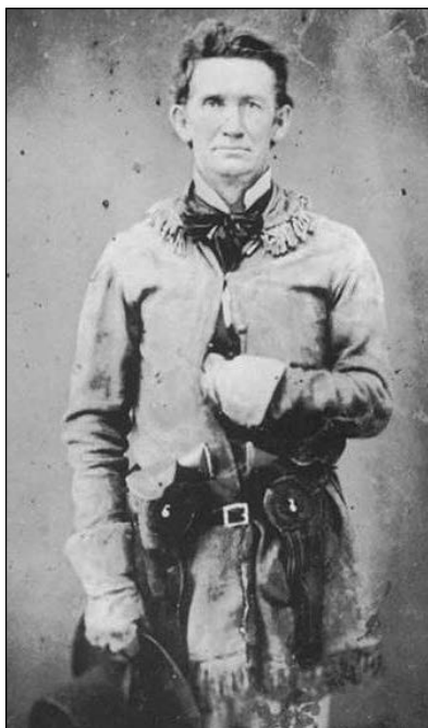
Major John “Rip” Ford,” a Mexican-American War veteran, led the Texas Ranger volunteers during the First Cortina War.

The events at Brownsville, though relatively minor in scale, sent political shockwaves across the region. George Woods, the governor of Texas and a veteran officer of the Creek and Mexican-American Wars, distrusted the dispersed U.S. Army garrisons to respond quickly and immediately authorized an improvised expedition of state-funded Texas Rangers to counter the militants. He appointed William Tobin, a former Marshal of San Antonio, as commander and dispatched the company south to break the ongoing “siege” at Brownsville. Despite the Texans' aggressive intentions, on 20 November Cortina's force defeated a detachment of the rangers while killing three in the fight. When Tobin found the bodies of his men, they had been mutilated and left to rot in the sun. For many Texans who yet retained ethnic enmity over atrocities at places like the Alamo and Goliad just 23 years earlier, the fight had gained a larger significance. 5