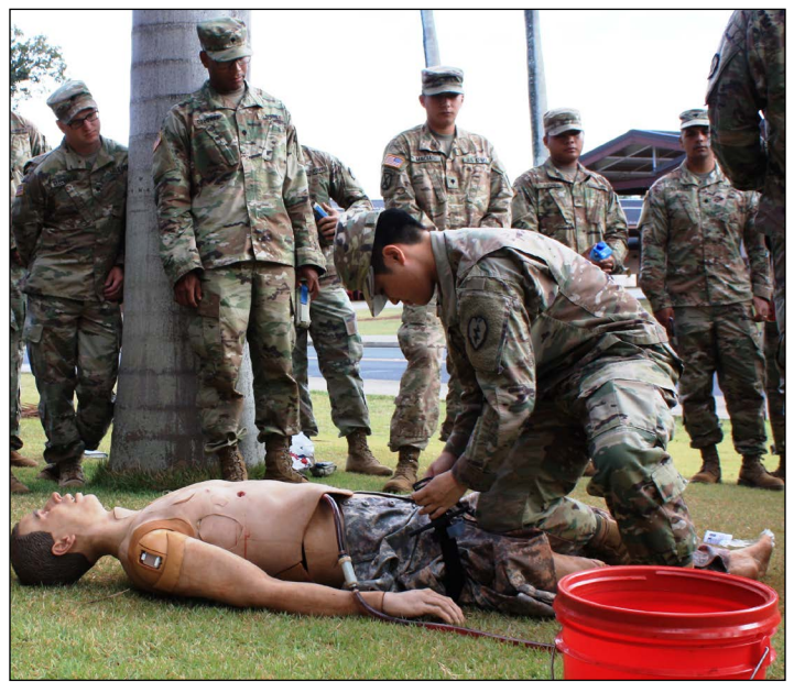
A Soldier applies a tourniquet to a mannequin during Squad Overmatch training at Schofield Barracks.

"We just can't rely on a cadre of outside instructors," he said. "We want to pass on the knowledge to a unit so they