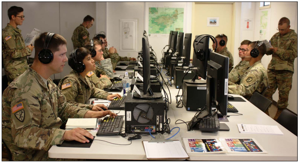
A squad rehearses missions with Virtual Battlespace 3 as part of Squad Overmatch training.

halted the training. In an instant, the squad members' avatars returned to the starting point and this time moved out in proper order. The quick reset shows one of the strengths of virtual training. When things go wrong, it's easy to begin again as opposed to a time-consuming restart in a live exercise.