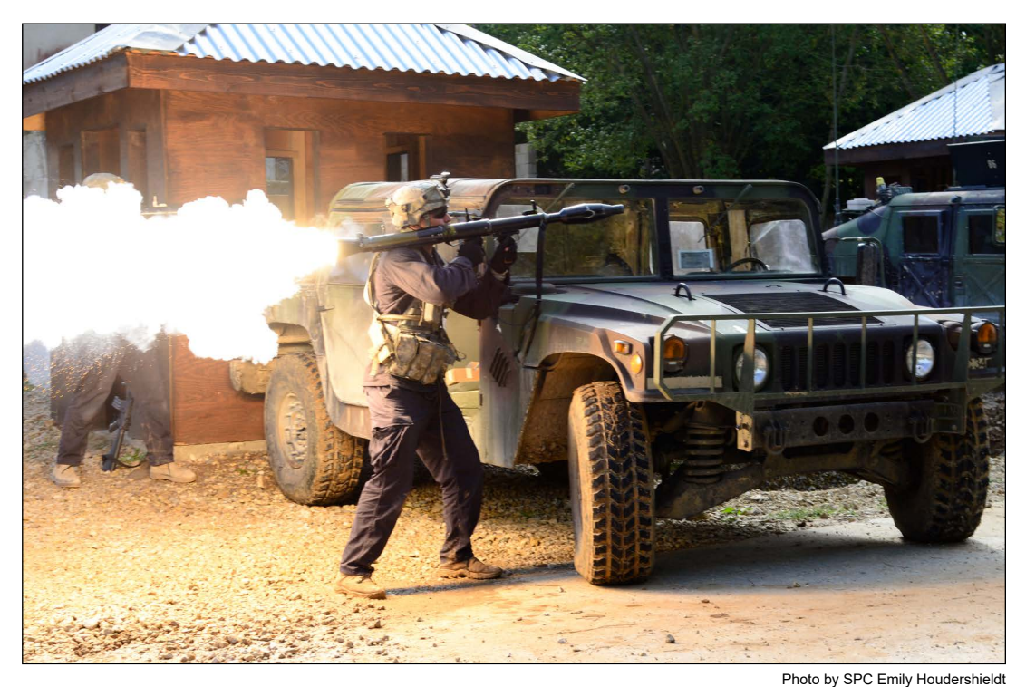
An OPFOR soldier fires a simulated rocket-propelled grenade during Allied Spirit V at the 7th Army Training Command's Hohenfels Training Area, Germany, on 12 October 2016.

of collection and analysis assets at its disposal. However, the force structure distributed the intelligence assets among multiple headquarters, and several did not even fall directly within the brigade (SEAL platoon and UK pathfinders reported to division through a separate chain of command). This created multiple steps between target acquisition, decision, and delivery which made the unit susceptible to deception. The 1-4 IN operates a much flatter collection plan with all assets reporting to one intel cell. The unit had a similar advantage in the fires warfighting function, with a single mission command post receiving, approving, and processing all fire missions. The RTU's larger