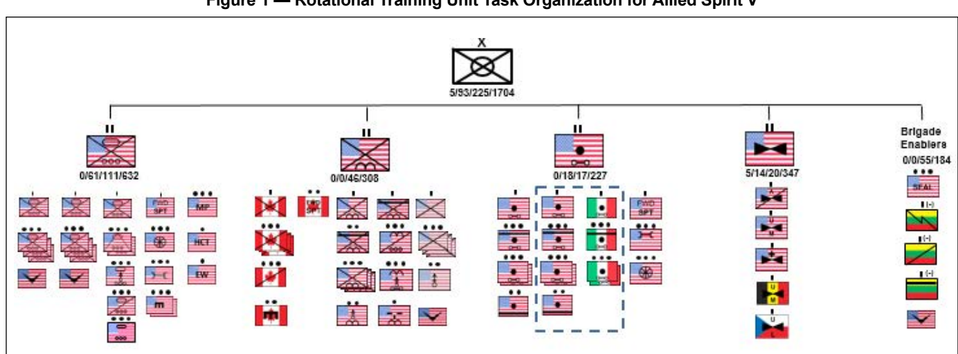
Figure 1 — Rotational Training Unit Task Organization for Allied Spirit V

The 1-4 IN fought with a total of four companies. Two mechanized infantry companies had three tanks and six infantry fighting vehicles (IFVs) per company. One engineer company had three sapper platoons and two D7 blade teams. One recon company consisted of one mortar platoon fighting as mounted infantry, one anti-tank platoon, and two platoons of special purpose forces (SPF - essentially OPFOR special operations forces). The 1-4 IN had significant artillery at its disposal including an artillery battalion (152mm howitzers), a 120mm mortar platoon, a multiple launch rocket system (MLRS) battery capable of firing chemical munitions, scatterable mines, conventional high explosive (HE), and dual-purpose improved conventional munitions (DPICM). The 1-4 IN also had a Mi-35 Hind air weapons team (AWT) at its disposal and direct support from brigade-level UAS and counterfire radar. The 1-4 IN's mission was attack to neutralize the RTU to enable the seizure of Nurnberg by the division DO.