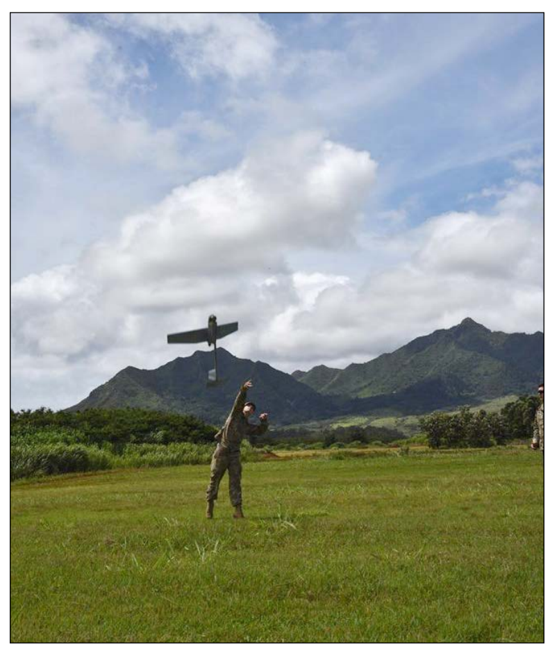
The fire support NCO for C Company, 1-21 IN launches a Raven to provide aerial reconnaissance of the objective and adjust indirect fires.

with the plan allowed me to manage the fight at a higher level and ensure conditions were set for upcoming key events. Commanders no longer need to be in the direct fight, but rather they should manage from a vantage point that allows them to see the battlefield and prepare for the enemy's next action.