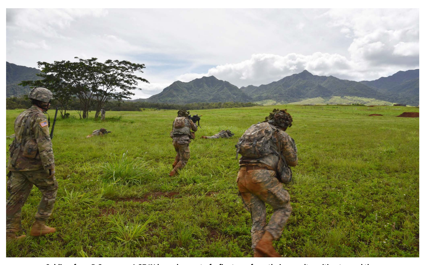
Soldiers from B Company, 1-27 IN bound as part of a fire team from their assault position toward the breach site. The objective required extensive use of individual movement techniques, emphasizing the importance of basic Soldier skills and physical fitness.

Mastering battle drills — There was some initial skepticism within my troop when we found out we were executing a hasty raid for the CALFEX. "That's not something we would really do" was a sentiment that we had to squash