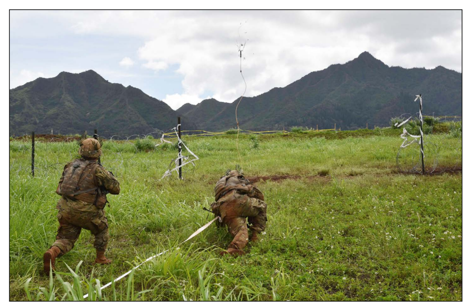
Sappers from B Company, 65th Engineer Battalion maneuver toward an obstacle by throwing a grappling hook to clear their path for mines. Sappers reduced wire obstacles during the assault using both live Bangalore torpedoes and live brazier charges.

and battalion fires. This worked well as he started to only update me on what I couldn't hear on battalion fires. He figured out that I could hear all of the RW traffic; so instead of repeating everything, he just asked, "Sir, did you hear that?" if I needed to make a timely decision or clear RW hot. This FSO/commander working relationship was critical to our success on the last couple missions.