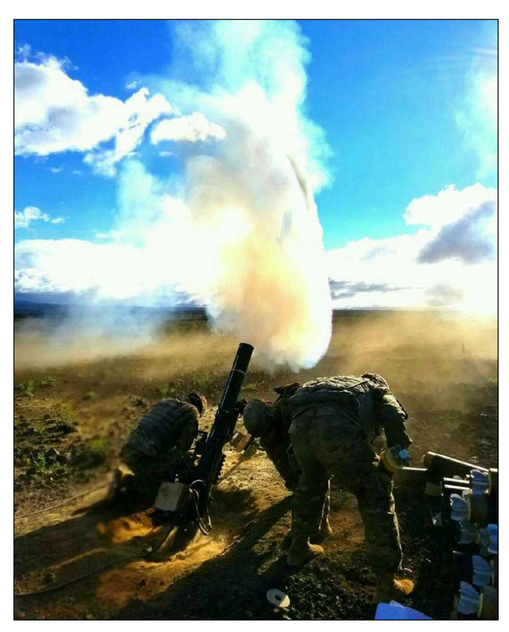
Mortarmen from the 1-21 IN mortar platoon provide both 120mm and 81mm mortar support for the assault.

Iteration. Since our mission was vastly different than any of the other units that had gone (to include the mounted D companies and our squadron's dismounted reconnaissance troop), I'll lead with our mission, which was to screen in depth in order to deny the enemy the ability to counterattack. This mainly called for us to synchronize enablers as we observed an advancing enemy force. I was extremely impressed with my PLs, platoon sergeants, and junior leaders for the way they took initiative during the entire operation — specifically, the way they were able to handle enablers at their level and synchronize assets pushed to them. Additionally, the communication between the platoons demonstrated a shared understanding of direct fire planning and locations on the battlefield, allowing for easy deconfliction of direct fires and, again, synchronization of fire support assets during periods of maneuver. What follows are lessons learned that we will definitely carry with us into Lightning Forge and beyond.