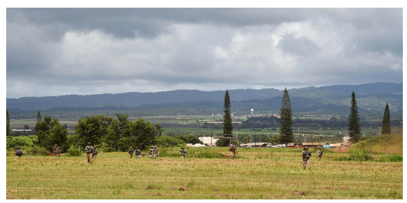
Soldiers from C Company, 1-27 IN disperse to cross an open danger area (ODA) under the cover of artillery obscuration and suppression.

The highlight of my personal lessons learned was that teamwork and lateral cross-talk makes mission command efficient. In theory, I could have been an effective commander by directing all actions as fast as I could talk on the radio (we all know we shouldn't try that), but to be effective and efficient and maintain a desired tempo, I had to rely on my PLs, 1SG, and XO. My confidence to fight my company grew as I started focusing on describing the endstate more than describing the action. I now have an experiential frame of reference to confirm that I can do more than one thing at a time when I focus on describing the endstate and trusting my leaders.