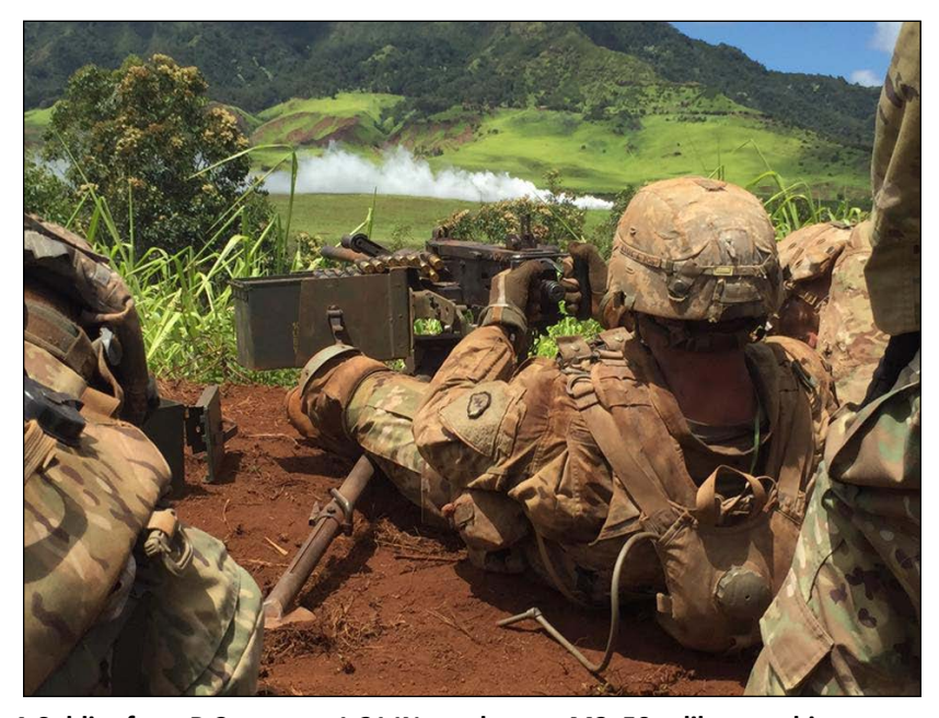
A Soldier from B Company, 1-21 IN employs an M2 .50 caliber machine gun to suppress the objective while engineers breech an obstacle. Moving dismounted with the M2 for more than a kilometer proved difficult, but it provided a very robust support-by-fire position.

Fires planning — Understanding how to make fires responsive and timely was a struggle. Interestingly, both my FSO and the FSO I observed in another company found solutions with completely opposite methods. We grouped our targets and limited our fires to three simple groups: one to disrupt and fix, one to suppress and obscure