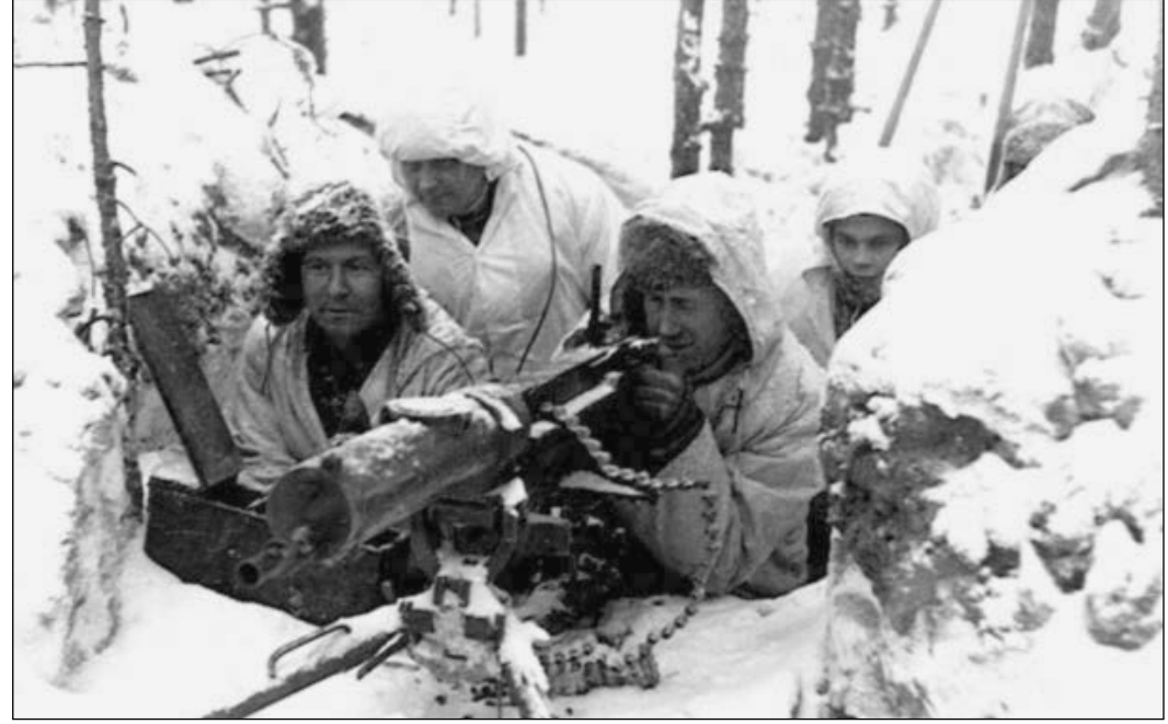
Finland: A Country Study, Library of Congress

The term motti was most likely coined by some of the woodsmen that made up the Finnish army. 52 In Finnish, motti refers to a bundle of logs or a pile of timber that is held in place by stakes but will later be cut into more conveniently sized lengths of firewood. In the context of the Winter War, the term came to describe the physically isolated Russian units that would be destroyed piecemeal by the Finns.53 The Finns essentially utilized their knowledge of the terrain and their skill in navigating the winter landscape to dissect the larger Russian elements into small pockets that were more manageable for their small units. In these road-cutting operations, the Finns minimized the Russian advantages