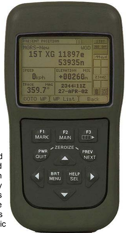
Defense Advanced GPS Receiver

The company started movement at 2100. After the company reached all of its checkpoints, the scout platoon occupied its