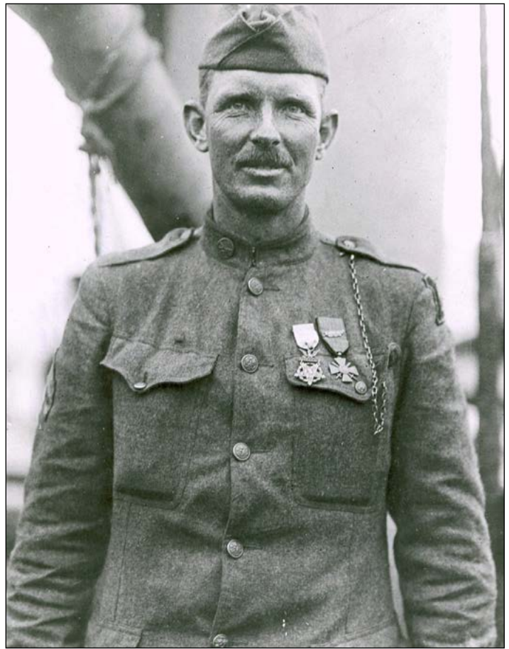
CPL Alvin York nervously poses for the camera on the deck of the SS Ohioan after docking in Hoboken, N.J., on 22 May 1919. He had no idea that an April 1919 article in the Saturday Evening Post about his battle exploits had made him a national hero. York was officially welcomed by the Tennessee Society and whisked away to be feted in New York City and Washington, D.C.

I got in bad company and I broke off from my mother’s and father’s advice and got to drinking and gambling and