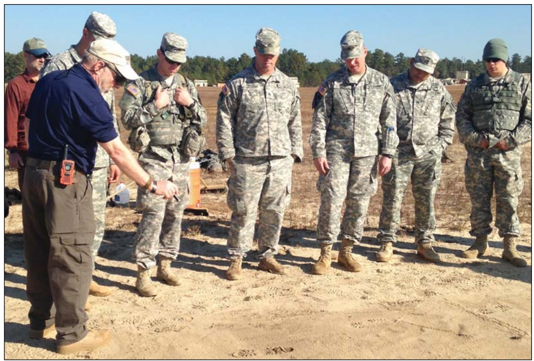
An ASA course instructor teaches the three key elements of a footstep as part of "Using Critical Thinking to Interpret Ground Sign Awareness" training.

The ASA course educates and trains Soldiers on the human sensory system (five senses and the brain), the six domains of human behavior (heuristics, autonomics,