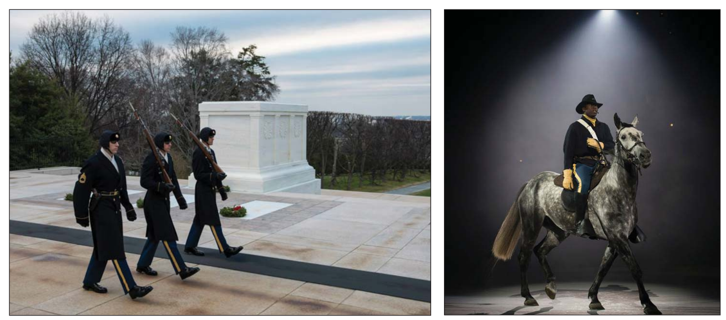
Above left, tomb sentinels complete a changing of the guard at the Tomb of the Unknown Soldier at Arlington National Cemetery. Above right, a Soldier with the 1st Battalion, 3rd U.S. Infantry Regiment portrays a Buffalo Soldier during a Spirit of America 2014 tour event.

sequence in response to being activated for a state funeral. Each mission offers no room for error.