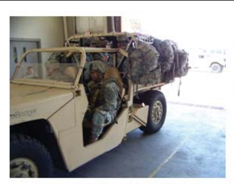
BOEING PHANTOM BADGER