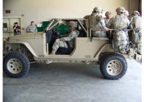
HENDRICK DYNAMICS COMMANDO