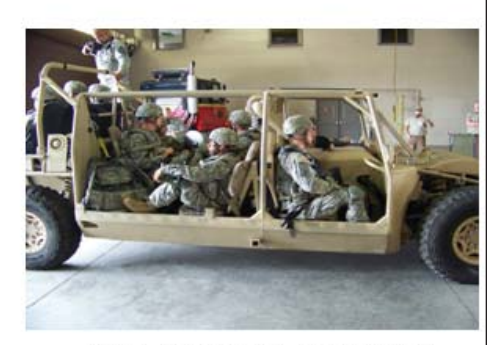
VYPER ADAMS MODULAR PLATFORM VEHICLE