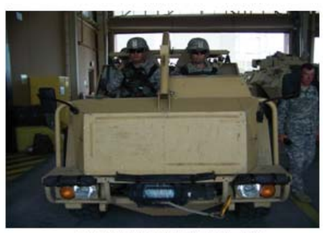
LOCKHEED MARTIN COMMON VEHICLE NEXT GENERATION