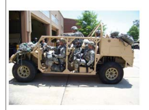
GENERAL DYNAMICS ORDNANCE AND TACTICAL SYSTEMS FLYER GEN III