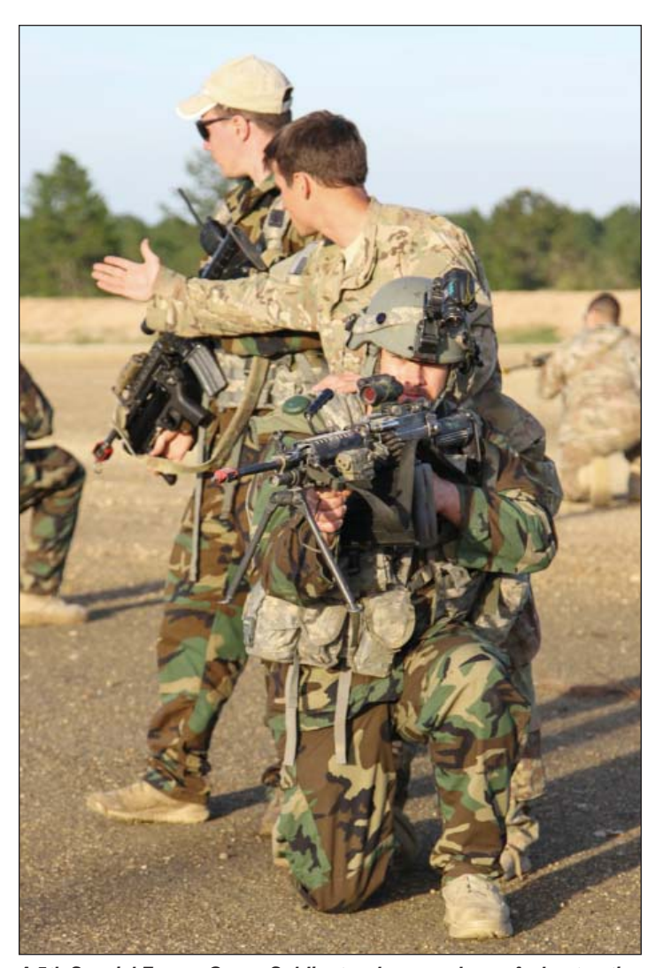
A 5th Special Forces Group Soldier teaches members of a host-nation force (role-played by U.S. Army Soldiers) how to assign sectors of fire before a training mission at JRTC on 12 April 2014.

Probably the most important human element an LNO