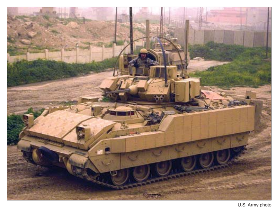
The ECP program will enable the Bradley to keep pace with Army modernization, remaining capable and relevant into the next decade and beyond.

communications with all elements of the brigade sustaining situational awareness during decisive actions while on the move. The improvements in networked communications also provide the ability to maintain situational awareness between mounted and dismounted Soldiers including voice, digital, and video capabilities.