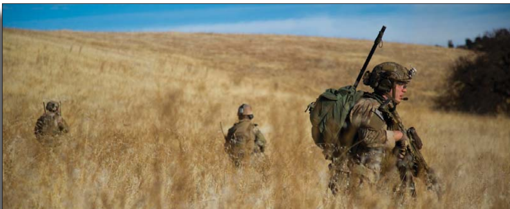
U.S. Army Rangers assigned to 2nd Platoon, Alpha Company, 2nd Battalion, 75th Ranger Regiment, infiltrate an objective on foot during task force training at Fort Hunter Liggett, Calif., on 27 January 2014. Rangers are constantly training to maintain the highest level of tactical proficiency.

Command of Honor is a readable, engaging, and entertaining chronicle of Truscott's involvement in World War II. It provides a fascinating depiction of one of the war's unique, remarkable, but frequently overlooked American heroes. I recommend Command of Honor to anyone wishing to learn more about Truscott and his triumphs during World War II. It is a stirring story of a great military leader who became a revered but humble hero of World War II.