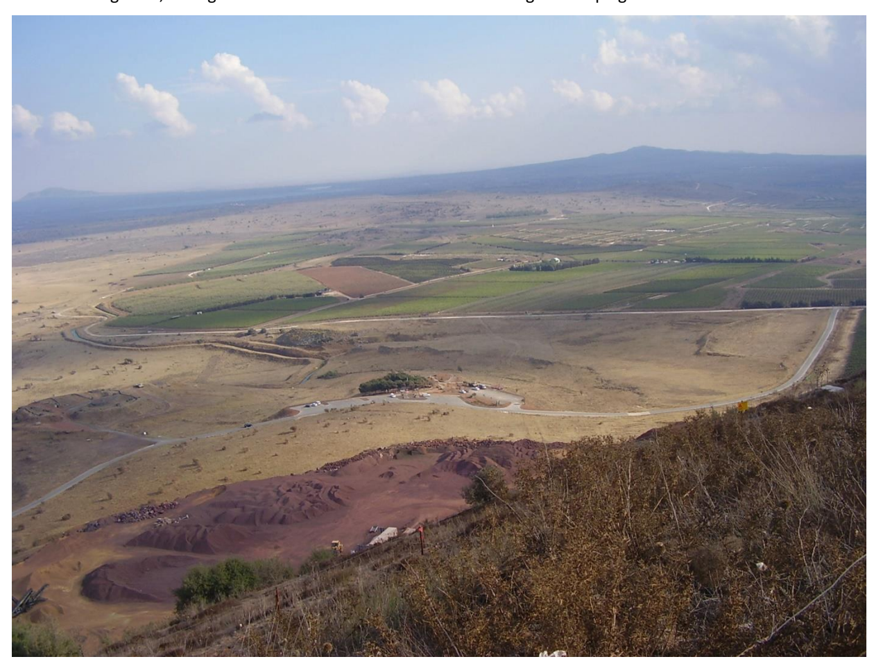
Figure 1. The battlespace, Valley of Tears, Israel.

The OZ (the Hebrew acronym for courage) 77<sup>th</sup> Armored Battalion, commanded by LTC (later BG) Avigdor Kahalani, would conduct a classic area defense culminating with the Battle of the Valley of Tears. Despite overwhelming odds, the fight Oct. 9 turned the tide of the Golan Heights Campaign in Israel's favor.