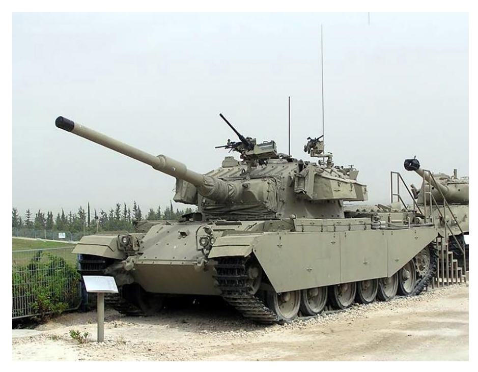
Figure 5. An improved Israeli Centurion tank at the Israeli Armored Corps Museum. This tank was considered in many respects superior to the Soviet T-54/55 the Syrians deployed in the Golan Heights Campaign.