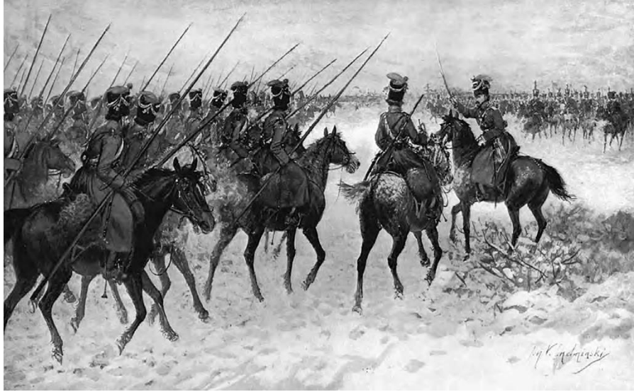
Figure 2. As irregular cavalry, the Cossack horsemen of the Russian steppes were best suited to reconnaissance, scouting and harassing the enemy's flanks and supply lines.

The Russian army refused to provide Napoleon with the opportunity for a decisive battle that would fit his strategy of destruction. Napoleon began his withdrawal from the ashes of Moscow Oct. 16, hoping to beat the Russian winter. He did not. Napoleon abandoned his army as it disintegrated and froze. Some 27,000 soldiers of the original 500,000-strong Grand Armée survived.