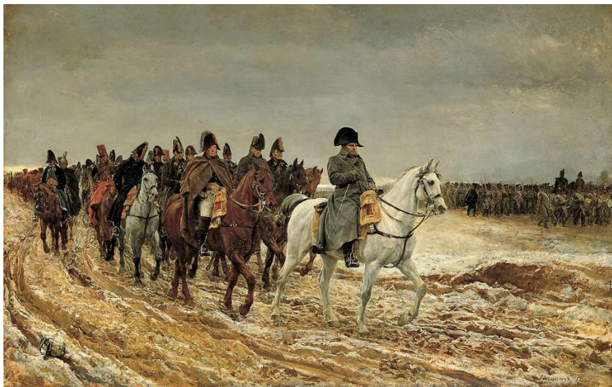
Figure 1. A 1920 painting depicts Napoleon's retreat from Moscow.

Russia defeated Napoleon's invasion by losing battles, yet maintaining and rebuilding its army throughout successive retreats. As the army retreated, the Russians set fire to their own crops and villages, leaving scorched earth behind. Napoleon seized Moscow, yet Russia still refused to surrender and soon flames consumed Moscow. Napoleon had reached his culminating point, and his supply lines stretched to breaking. Russia was fighting a strategy of "war of attrition," whereas Napoleon was fighting a strategy of "destruction."