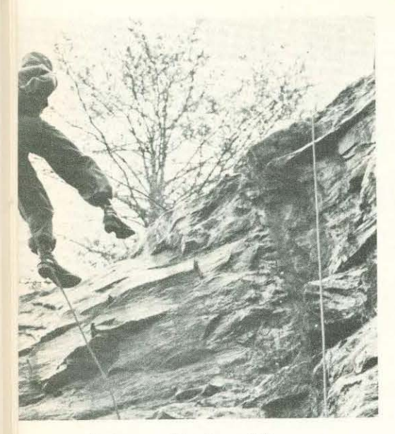
A Ranger "On Rappell."