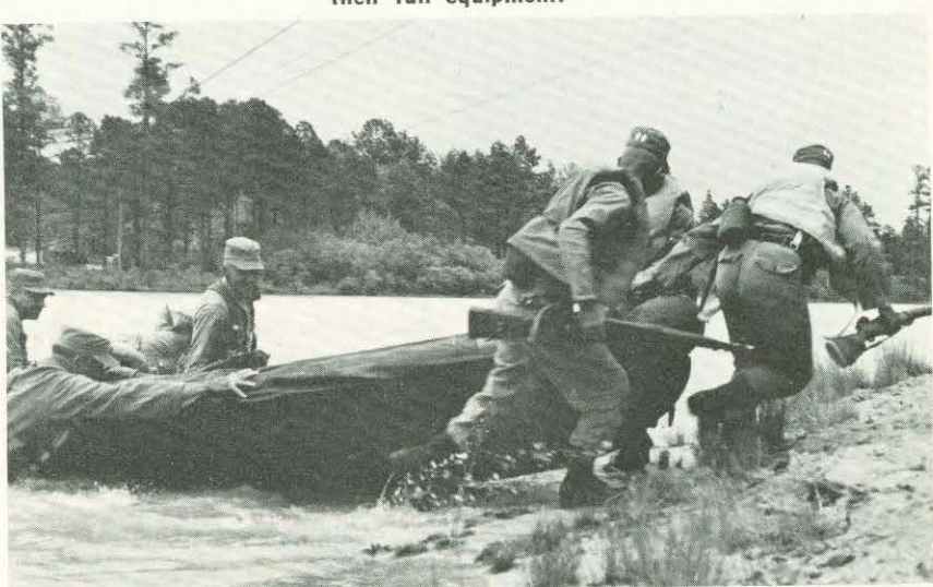
During their training in Florida, Rangers use pneumatic boats for amphibious landings and river crossings.