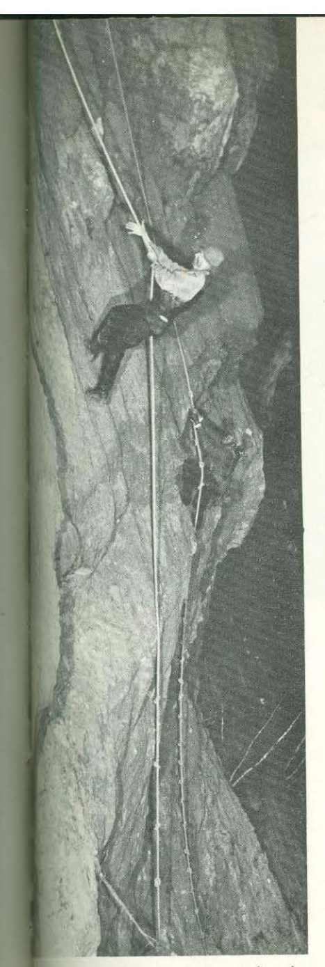
The use of ropes and mountaineering techniques enable Rangers to negotiate difficult obstacles.