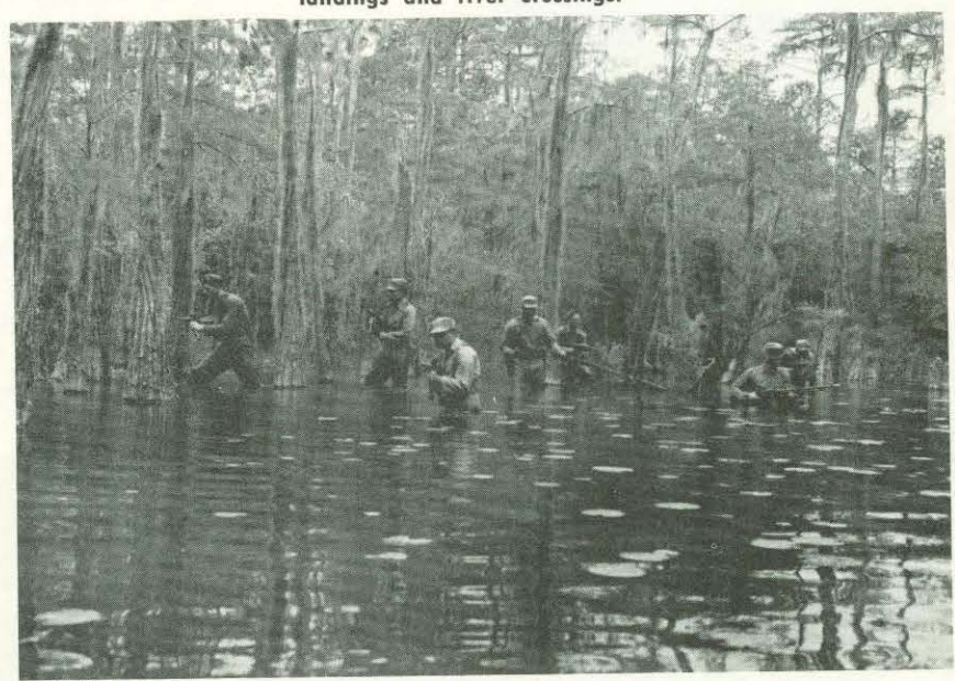
Mental determination must accompany physical strength to complete Ranger Training successfully.