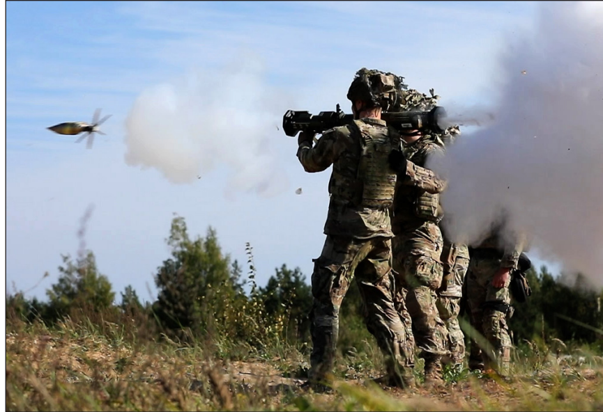
Soldiers with 1st Battalion, 506th Infantry Regiment conduct AT4 live-fire training in Adazi, Latvia, on 17 September 2023.

battle damage assessment reporting requirement is crucial (when observation is possible) because it reinforces the purpose of the platoon's mission — suppression of Objective Blue Linx in support of their sister platoon.