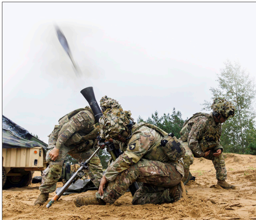
Mortarmen in 1st Battalion, 506th Infantry Regiment “Red Currahee,” 1st Infantry Brigade Combat Team, 101st Airborne Division (Air Assault), fire an 81mm mortar system during a fire support coordination exercise at Camp Adazi, Latvia, on 26 August 2023.

After completing Joint Readiness Training Center (JRTC) Rotation 22-10, the 1st Battalion, 506th Infantry Regiment, 1st Brigade Combat Team, 101st Airborne Division (Air Assault), identified digital fires capabilities as a gap in our training progression and fires enterprise. Our battalion's training glidepath after JRTC already included a machine-gun (MG) academy concept to validate tactics, techniques, and procedures (TTPs); standard operating procedures (SOPs); and crew drills across the formation and build proficiency within weapon squads. We chose to incorporate weapons squads into the digital FSCX to maximize training at echelon and focus on transitions from indirect to direct fire. Including these squads also provided