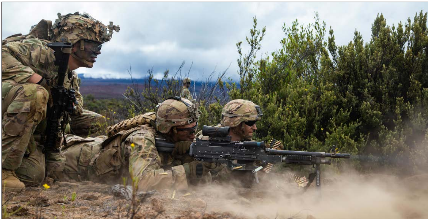
A gun team with 1st Battalion, 27th Infantry Regiment "Wolfhounds," 2nd Infantry Brigade Combat Team, 25th Infantry Division, lays suppressing fire during an FSCX on 17 November 2019. The FSCX is one of the most realistic training events offered, allowing junior leaders to gain practical experience with calling coordinated fire missions and observing fires effects when paired with a maneuver element.

Lastly, inclusion of the CAB was critical to the quality of the operation. C/T commanders controlled AH-64s for the entirety of the operation. Due to the gun target line, they were forced to decide when to commit attack aviation and when to hold them back while employing indirect fire systems. Air assault operations were a secondary training objective for the FSCX, but we found significant development and learning