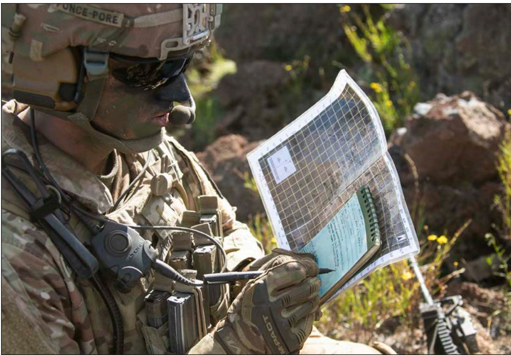
A Soldier with the 2nd Infantry Brigade Combat Team, 25th Infantry Division plans out fire missions during a fire support coordination exercise on 19 November 2019 at Pohakuloa Training Area.

to leaders about developing and becoming adaptive, flexible officers and NCOs who are prepared to lead our country's Soldiers to win in battle. This exercise was designed to test this very concept. The brigade leadership passionately believed combat should not be the first time junior leaders should control echeloned assets, feel and see the effects of large munitions at close range, and be placed under a tremendous amount of stress. As an example, the first time many of the senior leaders within the brigade experienced live ordnance drops from an aircraft was in combat as young officers and NCOs.