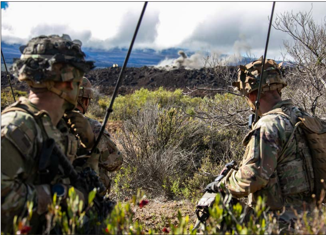
Soldiers with the 1st Battalion, 27th Infantry Regiment observe incoming fires effects during an FSCX on 18 November 2019 at the Pohakuloa Training Area.

in this area. As an IBCT, all leaders must be comfortable conducting air assault planning and execution. All C/T CARs included lift and attack aviation pilots, which increased shared understanding and added tremendous training value.