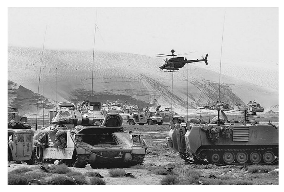
Figure 2. Division Cavalry in the war on terror's march to Baghdad.

Cavalry formations proved highly effective during Operation Iraqi Freedom in 2003 in a chaotic operating environment amid limited intelligence regarding enemy activities. The 3<sup>rd</sup> Squadron, 7<sup>th</sup> Cavalry Regiment, 3<sup>rd</sup> Infantry Division's Cavalry squadron "performed the full range of recon, security and economy-of-force operations to include screen, guard, cover and blocking, and it seized critical objectives in advance of the division's main effort."