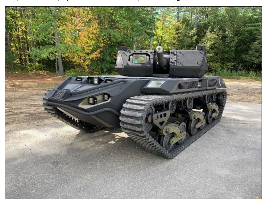
Figure 5. Robotic Combat Vehicle-Medium prototype.

In a 2030 scenario, the squadron enhances its ability to perform R&S and economy-of-force operations by employing advanced and emerging technologies like robotics, autonomous systems and loitering munitions. With these future organic capabilities, it will have an extended range, thus enabling it to cover more avenues of approach and influence the enemy farther out. The squadron can identify enemy formations using its organic and attached assets, such as medium and long-range unmanned aerial systems (UAS) and attached long-range fires. Once the squadron identifies an enemy formation, it can target it with enough firepower from advanced robotics and precision fires assets to destroy an enemy company in a small-scale mass precision attack. Employing loitering munitions at troop and squadron level will achieve this effect if appropriately used. This "pre-contact" loss of combat power can spoil an enemy operation and force him/her to change courses of action.