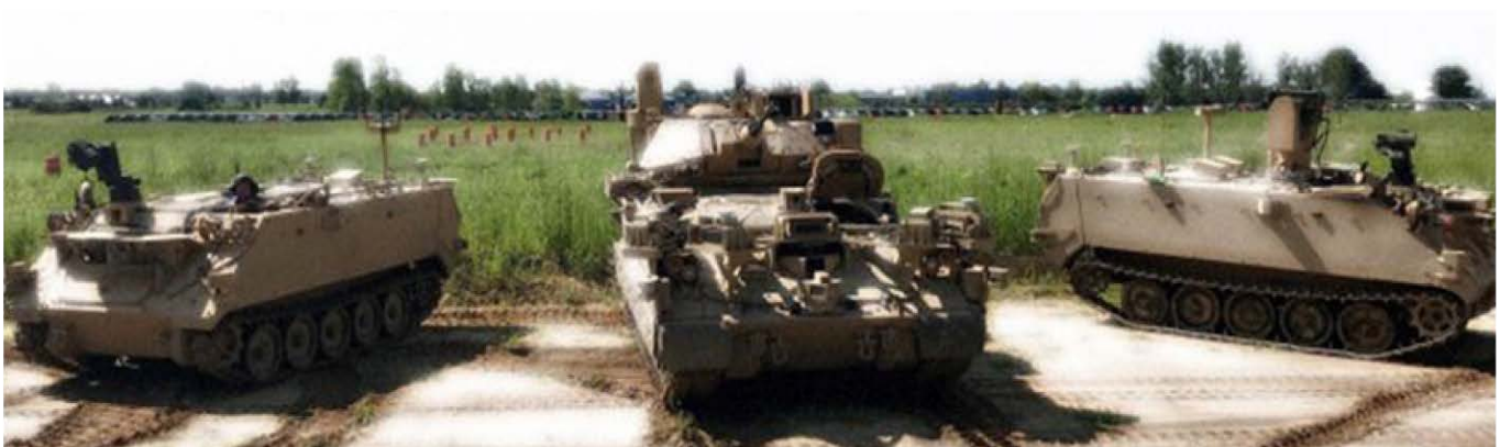
Figure 3. RCVs on display at Camp Grayling, MI.

OP – observation post PL – phase line R&S – reconnaissance and security RCV – Robotic Combat Vehicle UAS – unmanned aerial system