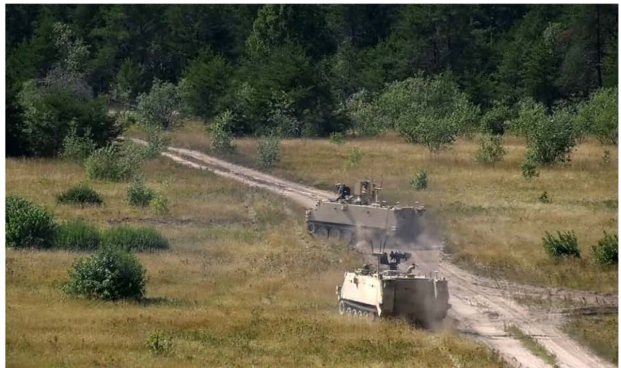
Figure 2. The Army's Ground Vehicle Systems Center and NGCV cross-functional team demonstrate the mission-enabling technologies demonstrator and RCV surrogate at Camp Grayling, MI, Aug. 22, 2019.