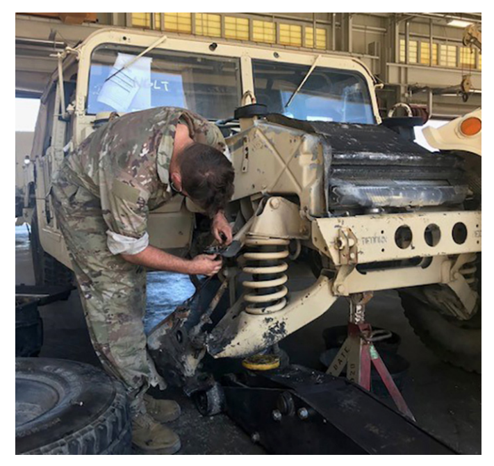
Figure 5. A maintenance Soldier prepares a humvee for turn-in per the PSD instruction.

The Team Harvest officer in charge and supply sergeant played a role in planning the MDRS, from helping the AFSBn-Hood / 13<sup>th</sup> ESC understand the challenges of turning equipment to passing on lessons-learned from unit transactions.