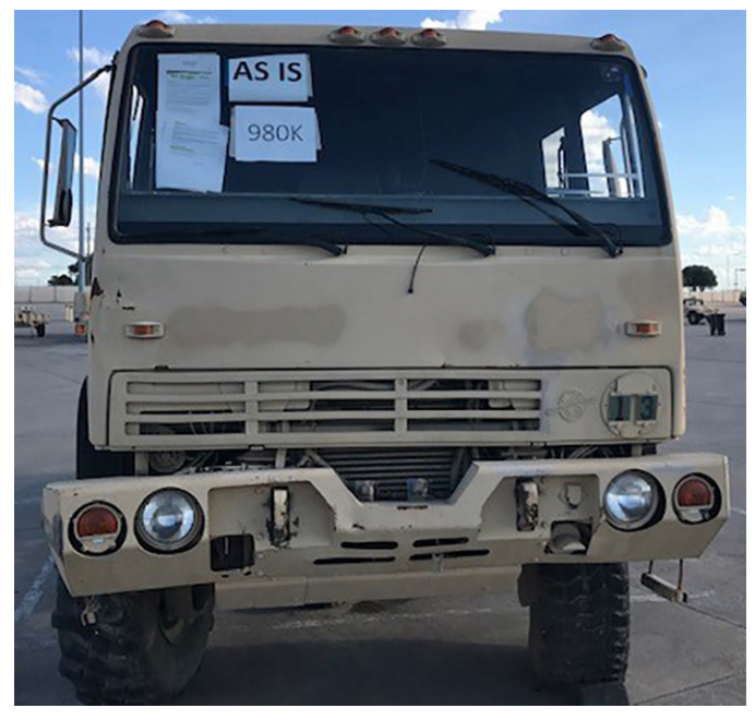
Figure 6. Pegasus Harvest marked equipment by type of turn-in, destination and attached instructions of how the equipment needed to be turned in.