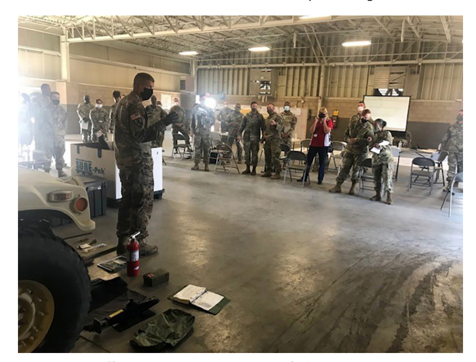
Figure 1. MG Jeffery Broadwater, commander of 1st Cavalry Division, speaks to division and corps leaders during Operation Pegasus Harvest.

The proposed make-up of Team Harvest was 45 Soldiers, which included one officer, one PBO (civilian or warrant officer), 13 noncommissioned officers and 31 Soldiers. Team Harvest then split up into two teams, a supply team and a maintenance team. The maintenance team's operation included preparing equipment for turn-in, stewardship of equipment in the motorpool and repairing the equipment if needed. The maintenance team needed to understand the disposition