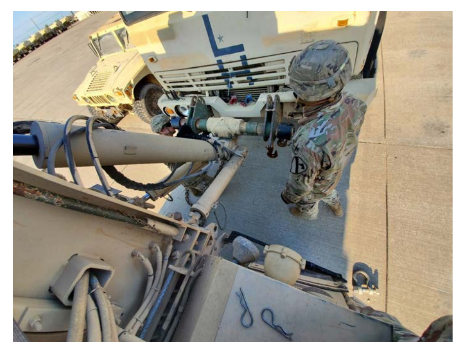
Figure 2. Wrecker crews support turn-in of rolling stock to DLA Disposition Services, AFSBn-Hood and the Modernization Displacement Repair Site (MDRS).

instructions to get the equipment suited for turn-in.