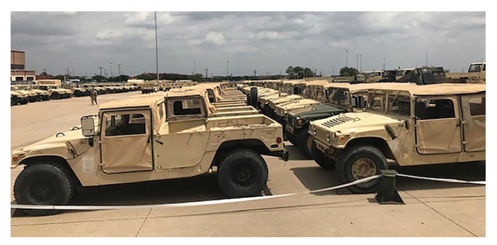
Figure 8. Pegasus Harvest supported the fielding of the Joint Light Tactical Vehicle by divesting all M-1097 humvee variants.