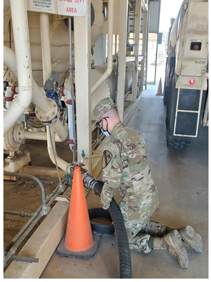
Figure 7. A Pegasus Harvest maintenance Soldier purges an M-978A2 Heavy Expanded Mobility Tactical Truck at a purge site.