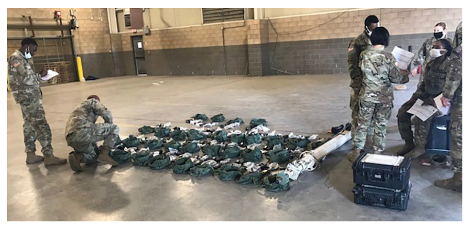
Figure 3. The property-book team receives equipment from units, examining paperwork and equipment.

"As is" turn-in: Requires Form DA 3161 (request for issue or turn-in), the printed deposition and be generally clean and free of debris. CoEl and BII shortages are required but not on order.