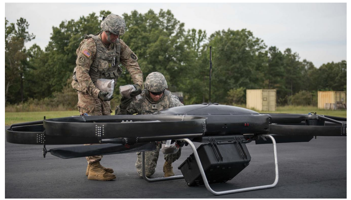
Figure 4. Soldiers of 3<sup>rd</sup> U.S. Infantry Regiment (The Old Guard) receive supplies from a Joint Tactical Aerial Resupply Vehicle (JTARV) on Fort A.P. Hill, VA, Sept. 22, 2017. The JTARV, a quadcopter also known as the hover-bike, could someday make it possible for Soldiers on the battlefield to order resupply and then receive supplies from an unmanned aerial vehicle.