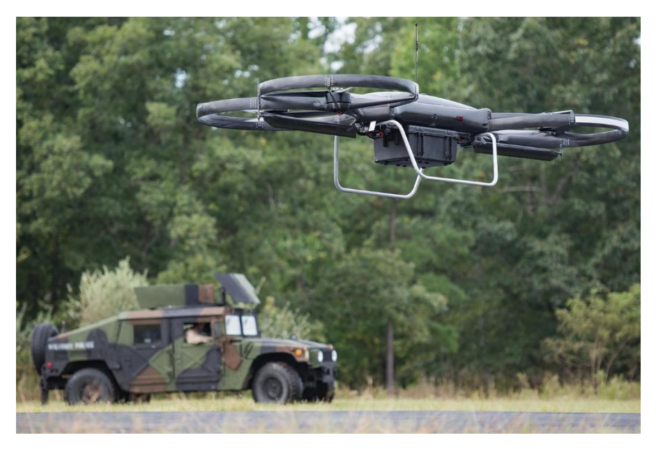
Figure 3. Soldiers of 3<sup>rd</sup> U.S. Infantry Regiment (The Old Guard), along with the Army Research Laboratory, participate in a Joint Tactical Aerial Resupply Vehicle (JTARV) exercise on Fort A.P. Hill, VA, Sept. 22, 2017. During the exercise, the JTARV showed its potential for one day making it possible for Soldiers on the battlefield to order resupply and then receive those supplies from an autonomous unmanned aerial vehicle.