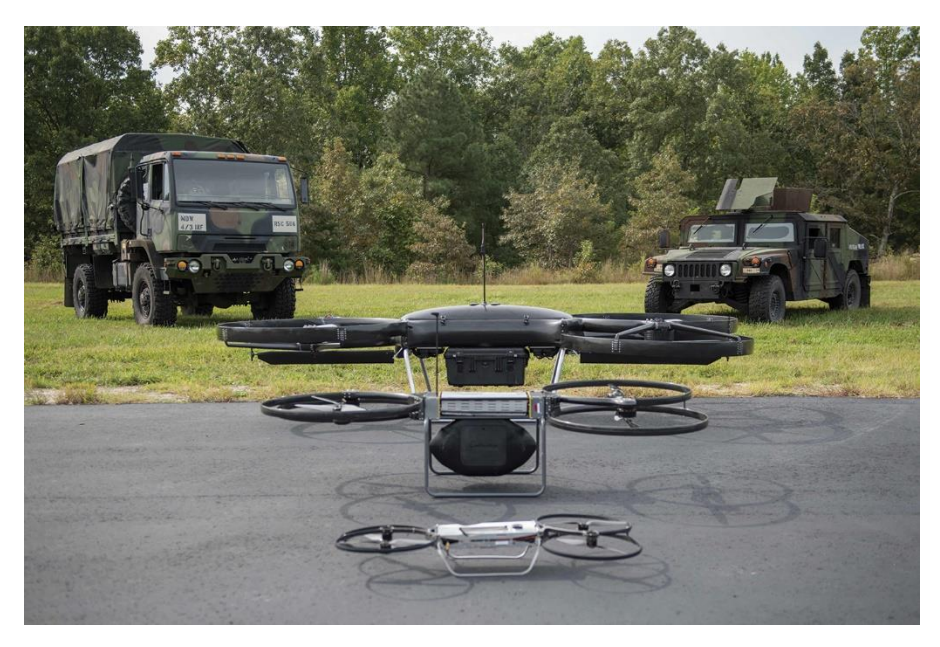
Figure 5. Soldiers of 3<sup>rd</sup> U.S. Infantry Regiment (The Old Guard), along with the Army Research Laboratory, participate in a JTARV exercise on Fort A.P. Hill, VA, Sept. 22, 2017. During the exercise, the JTARV showed its potential for one day making it possible for Soldiers on the battlefield to order resupply and then receive those supplies from an autonomous unmanned aerial vehicle.