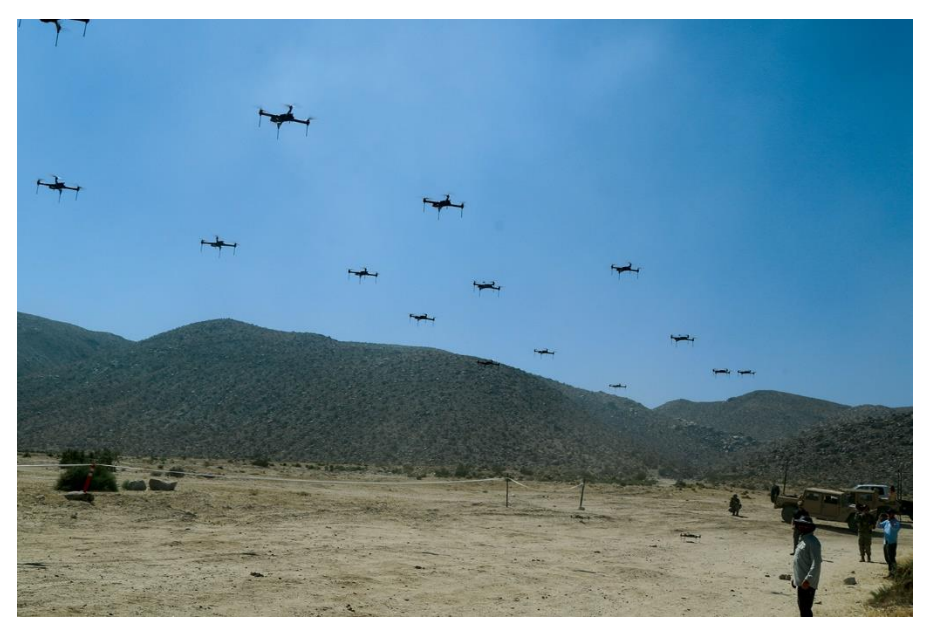
Figure 2. 11<sup>th</sup> Armored Cavalry Regiment and the Threat Systems Management Office operate a swarm of 40 drones to test the rotational unit's capabilities during the "Battle of Razish" on the National Training Center (NTC) May 8, 2019. This exercise was the first of many held at NTC located at Fort Irwin, CA.

JTARV – Joint Tactical Aerial Resupply Vehicle NTC – National Training Center UAV – unmanned aerial vehicle